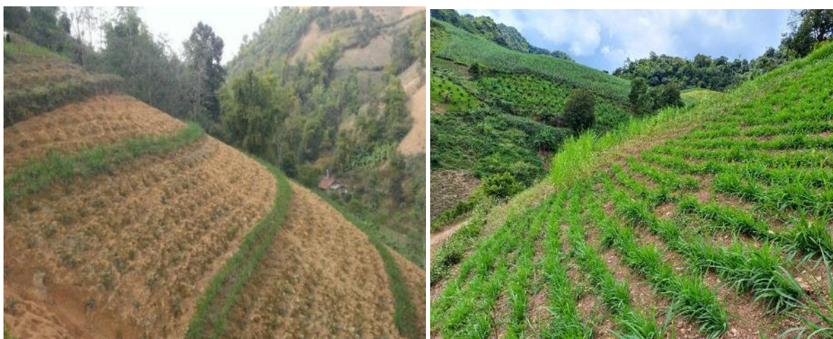
Forage grass grown on contours

Trial monitoring was conducted by project staff with the support of local stakeholders. The Northern Mountainous Agriculture and Forestry Science Institute (NOMAFSI) was the main local partner leading trial setup and monitoring. Data collection (germination rate, height, biomass yield [fresh matter (FM)] and farmer preferences, dislikes, and challenges) was done on selected farms in each village - > 3-5 farms per crop per village.