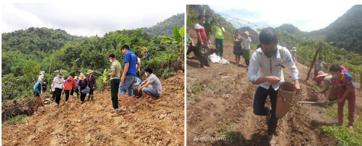
Field demonstrations on planting forages

Seeds of Mulato II, Mombasa guinea, Ubon paspalum and Ubon stylo were distributed and sown at the beginning of the rainy season (May). Planting materials for green elephant, pinto peanut and rice bean were distributed and sown mid-rainy season in June. Some households planted late due to shortage of rains mid-season and/or Covid-19 disruptions which caused slight delays in delivering materials and conducting on-farm demonstrations.