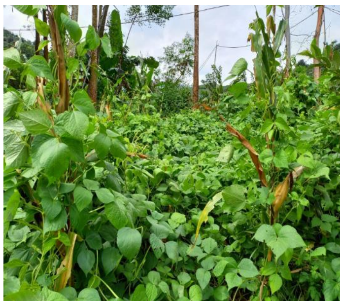
Rice bean intercropped with maize

Rice bean had the highest germination rate out of the 7 varieties ranging from 82-100% with Type C1 reporting 100% germination of sown seeds. As rice bean was planted later in the rainy season, low yields were reported at the time of sampling with only 1 harvest. Most farmers reported high to medium preference and intend to continue growing rice bean because it is a multipurpose -purpose crop (seeds can be used as food, biomass as feed, and because of additional benefits of improving soil health) and has a high germination rate. One constraint reported is the slow regrowth after the first harvest.