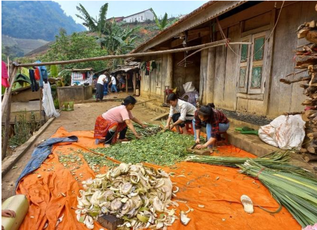
Preparing materials for silage