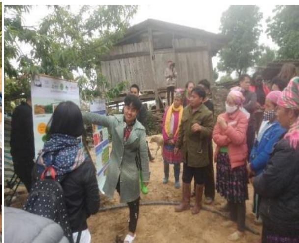
Introduction to feed techniques using posters