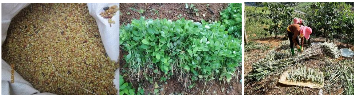
Forage seeds, seedlings (Arachis pintoi) and stem cuttings (Green elephant)