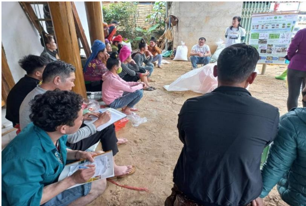
Farmers taking notes during the training