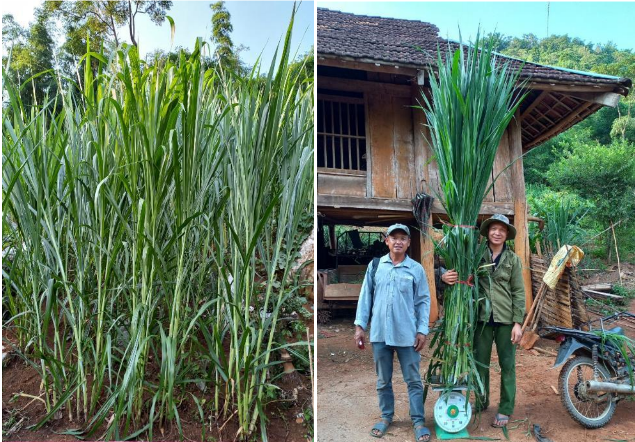
Green elephant grass

Green elephant grass showed a high germination rate of >81% across all farming system types except in Type C1 with 79% (Table 7). Average yield ranged from 33.8 – 82.1 tonnes FM/ha with Type A and C2 recording the highest biomass of > 82 ton/ha after the second harvest while Type C1 reported the lowest yield as farmers did not apply any fertilizer. All farmers showed high preference (100%) and expressed interest to continue growing this variety as it is high yielding, grows fast, has soft leaves and stem and is liked by cattle and buffalo. However, when harvested too early or fed in large quantities, green elephant grass contains a lot of water which can cause bloating and diarrhea in cattle.