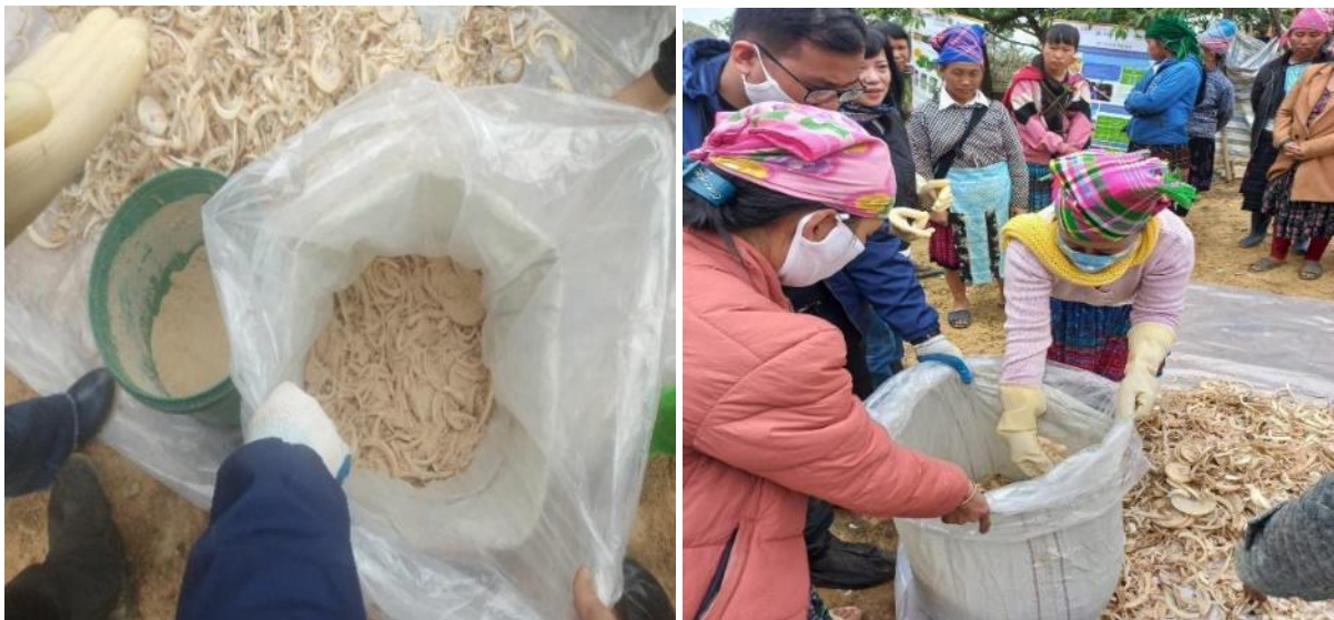
Silage preparation