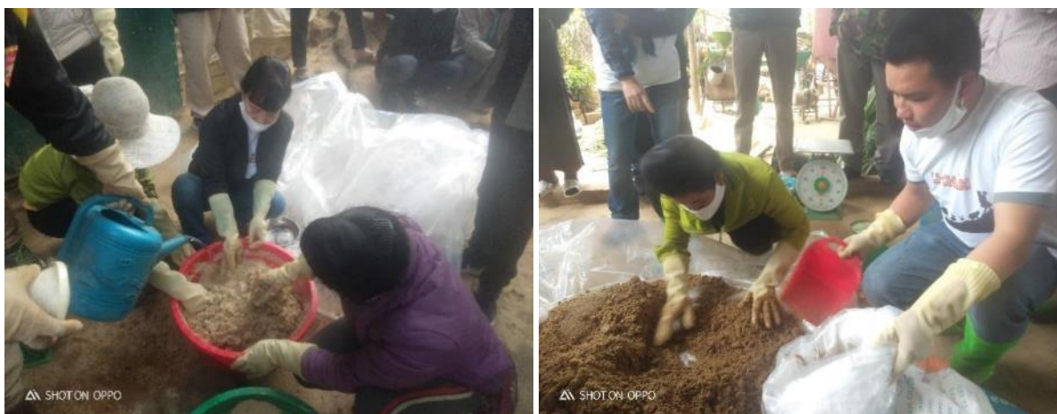
Concentrate feed mixing and feed fermentation using probiotics

At the end of each day, a game was organized where participants competed in answering questions related to the training topics. This enabled the project team to note what farmers learned and highlight the key areas that farmers needed to remember and was also a way to help farmers to discuss amongst themselves and consolidate the skills learned.