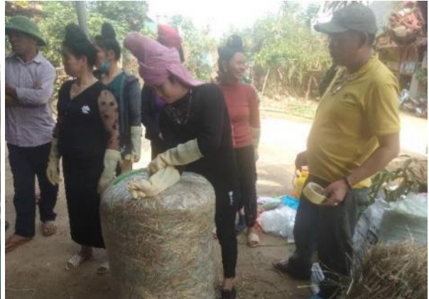
Preparing urea-treated rice straw