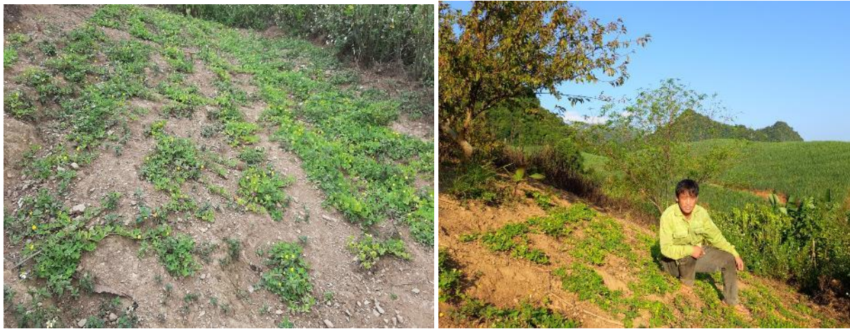
Pinto peanut grown as ground cover

predominant in this area. However, the farmers who showed high preference for pinto peanut reported benefits of adopting this variety as they could feed it to pigs, chicken, and cattle, and for ornamental use because of its beautiful blossom.