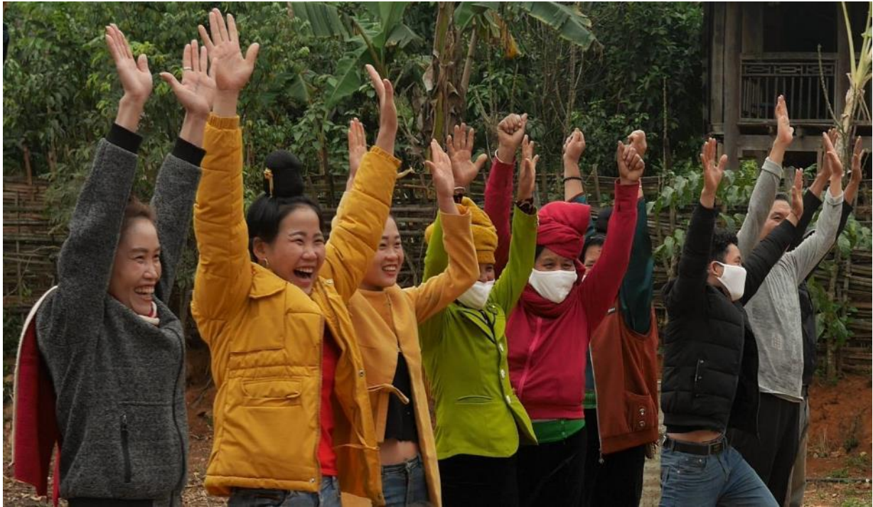
Farmers play a recall game after training