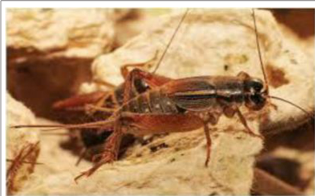
FIGURE 7 | Scapsipedeus icipe .

for Brachytrupes sp. and 83.9% for A. domesticus (82, 83). These protein digestibility values for the crickets are slightly lower compared to values for eggs (95%), beef (98%), and cow milk (95%) (84). On the other hand, the protein digestibility values for the crickets are higher than those of many plant proteins, such as sorghum (46%), maize (73%), wheat (81%), and rice (66%) (85).