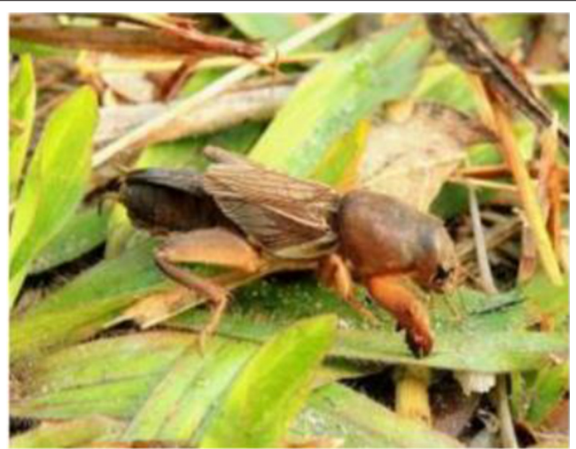
FIGURE 5 | Gryllotalpa orientalis . 15, February, 2014.