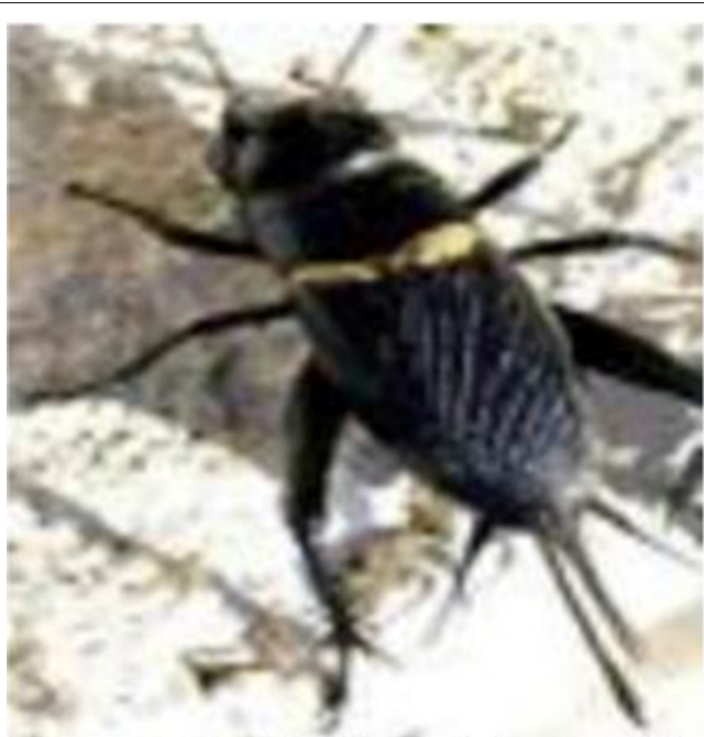
FIGURE 4 | Gryllus bimaculatus .