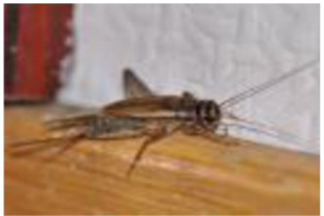
FIGURE 6 | Acheta domestica . 29 August, 2010.

drying, cooking, smoking, deep-frying, roasting, and toasting) before consumption (50, 80). Most of the edible crickets supply adequate energy and proteins to the consumer diet, at the same time meeting the amino acid requirements. Crickets also possess a high value of monounsaturated (MUFA) and polyunsaturated fatty acids (PUFA) (59, 67, 68). Besides, these insects are rich in micro-nutrient elements such as calcium, potassium, magnesium, phosphorus, Sodium, Iron, zinc, manganese, and copper as well as vitamins like folic acid, pantothenic acid, riboflavin, and biotin, which are the most deficient nutrients in humans (5, 29, 66). This therefore implies that crickets are a good source of various nutrients required by humans for proper