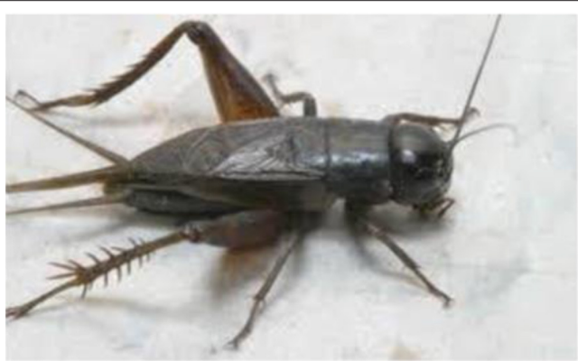
FIGURE 3 | Gryllus similis male.