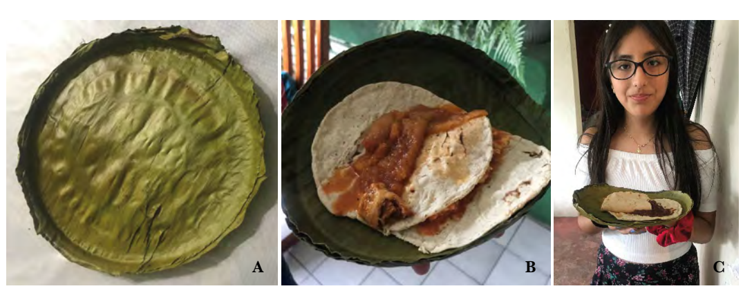
Figure 6 . Public demonstration of the biodegradable plates made from plantain ( Musa spp.) leaves and cassava ( Manihot esculenta ) starch in Monte Salas, municipality of Fortín de las Flores, Veracruz, Mexico. A) Prototype of the biodegradable plate; B) Local foods served in the plates; C) People from Monte Salas, consuming local foods served in the biodegradable plates.

to later proceed to the elaboration of the biodegradable plates. The event was attended by people from the town of Monte Salas, who were served in these prototypes that tested their resistance to solid food.