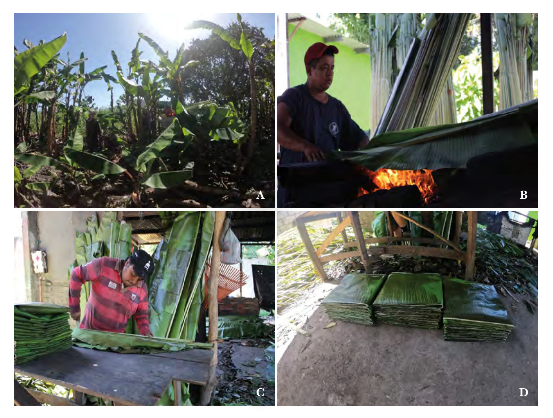
Figure 2. Process of production and manufacturing of plantain ( Musa spp.) leaves to prepare tamales and other regional and local foods in Monte Salas, Fortín de las Flores, Veracruz, Mexico. A) Leaf cutting; B) Leaf roasting; C) Leaf deveining (removing the central vain of leaves); D) Packing.

The cutters are employed by the traders who, through a verbal contract, make agreements with the plantation owners for the cutters to enter their farms to harvest the leaves.