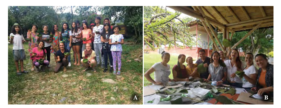
Figure 5. Workshops organized to demonstrate the techniques of elabotation of biodegradable plated from plantain ( Musa spp.) leaves and cassava ( Manihot esculenta ) starch. A) Bosqueschool Cariba, San Carlos, Antioquia, Colombia; B) Association of the Local Tourism Network, San Rafael, Antioquia, Colombia.

Back in Mexico, the same initiative was implemented in Monte Salas. Biodegradable plates were made for a festival, and they served as replacement for disposable plastic or styrofoam materials (Figure 6A). In such biodegradable plates, food was served (Figure 6B) previously taking the sanitation measures, which included the perfect cleaning of the leaf