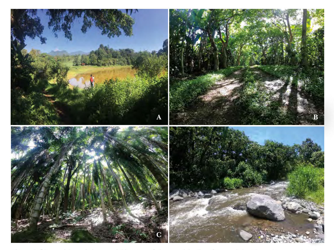
Figure 3 . Places with touristic potential in Monte Salas, municipality of Fortín de las Flores, Veracruz, Mexico. 3A) Tule Lagoon. 3B) Road to Tule Lagoon. 3C) Road to Monte Salas river. 3D) Monte Salas river.

Promotional videos were made in order to promote the banana production and leaf processing activities, and thus attract tourism to the area under study. To this end, places with tourist potential such as the Tule Lagoon, which belongs to Monte Blanco (Figure 3A) were visited, a trail towards the plantation where there are different tree species, as well as the banana crop (Figure 3B), a trail of palms that make the landscape attractive (Figure 3B), and the river that runs through the entire Monte Salas ravine. Crops such as chayote ( Secchium edule ), coffee and, of course, banana can be seen along these routes (Figure 3D).