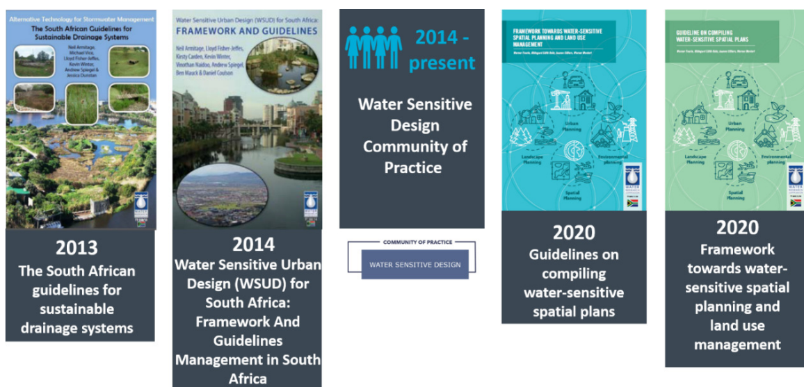
Figure 2. Milestones in the evolution of WSD in South Africa through the publication of guidelines and the establishment of the WSD CoP programme.

The initial phase of the WSD CoP programme (2014 to 2018) included purposeful engagement with a wide group of stakeholders and promoted knowledge integration in the field of WSD through, inter alia , an expanded training programme with a combined reach of over 1,000 water stakeholders in both the public and private sphere in South Africa (Carden, 2019). It was able to indicate that this approach has the potential to generate new understandings about innovative practices and reflexive learning within WSD in South Africa, and to develop knowledge connected to policy development and change to influence planning and design towards WSCs. The main focus areas of the first phase of the WSD CoP programme were: