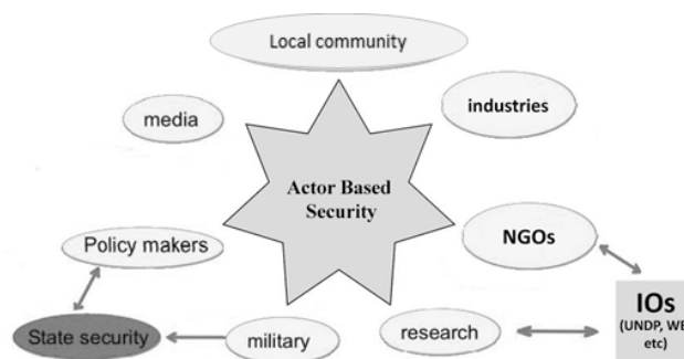
Figure 1. Actor-based security model adapted from [20].

vey their perspectives on security and threats in particular contexts, which can then be used as a basis for seeking compromises or solutions [20].