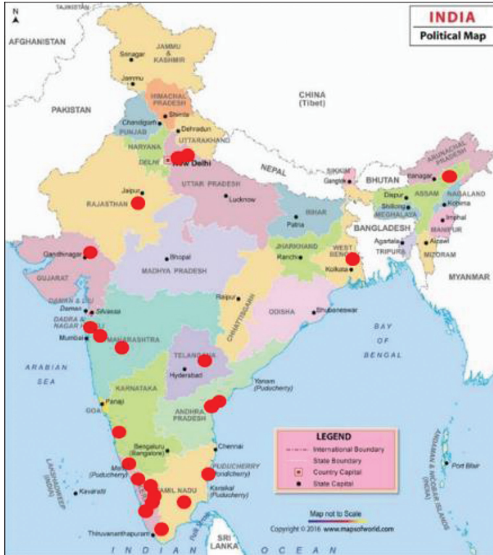
Figure 2: The 22 teams in 11 states in India trained in quality improvement science.

most joy – when they realise that they can let go of the pre-configured solutions and let the solutions appear through the exploration. This is the transformative moment. As mentors we get to hear of the subsequent excitement when they see results; and no matter how many teams you mentor the significance of this still always takes you by surprise.