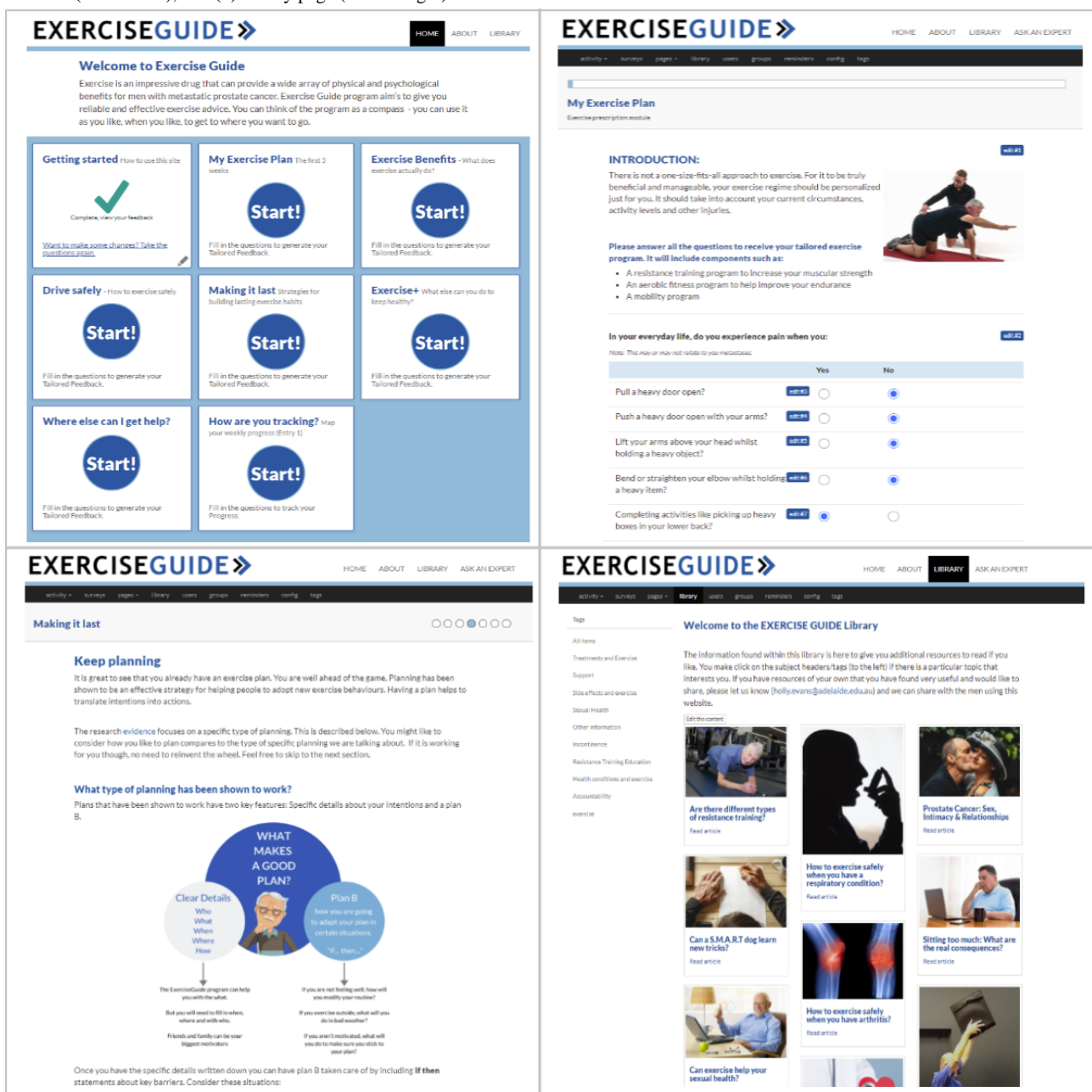
Figure 2. ExerciseGuide website screenshots of (1) the home page (top left), (2) Making It Last module tailoring questions (top right), (3) My Exercise Plan module (bottom left), and (4) library page (bottom right).

resource efficient [30]. The ExerciseGuide website was presented on either a Windows (Microsoft Corporation) or Apple (Apple Inc) laptop, as chosen by the participants. A researcher (HELE) asked the participants to verbally narrate their thought processes and feelings while completing the designated tasks on the ExerciseGuide website (Multimedia Appendix 1). The tasks included logging in, answering module questions (to read tailored content), generating their personalized exercise prescription, watching videos, and identifying key tools such as the library and frequently asked questions (Figure 2). When the participants fell silent for approximately 30 seconds or became stuck in a particular task, they were encouraged to express what they were thinking. The think-aloud sessions were audiotaped, and written notes were taken by the researcher.