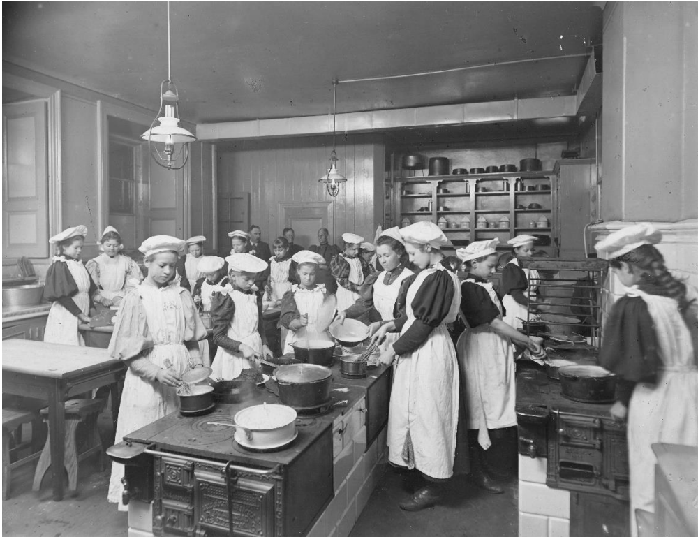
School kitchen, early 20 th century.

LR was formed in 1884 as Svenska Läraresällskapet (the Swedish Teachers' Association) and changed its name in 1913 to Läroverkslärarnas Riksförbund (National Union of Secondary Grammar School Teachers). In the wake of the Primary School Reform Act, which transformed the elementary school into a nine-year compulsory primary and lower-secondary school ( grundskola ), the union changed its name to the current one (Lärarnas Riksförbund). Among the many associations that joined LR were Kommunala Realskolans Lärarförbund (Teachers' Association of Municipal Junior Secondary School), Lektorernas Förening (Association of Senior Masters), Allmänna Adjunktsföreningen (General Association of Assistant Masters), Sveriges Yngre Läroverkslärares Förening (Association of Younger Secondary Grammar School Teachers), Praktiska Mellanskolors Lärarförbund