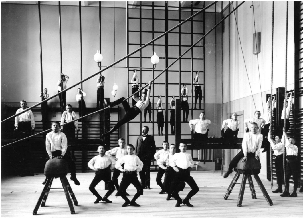
Physical training, early 20 th century.

(Teachers' Association of Municipal Practical Junior Secondary Schools), Sveriges Högre Flickskolors Lärarförbund (Swedish Teachers' Association of Advanced Girls' Schools) and Svenska Gymnastikläraresällskapet (Swedish Association of Physical Training Masters).