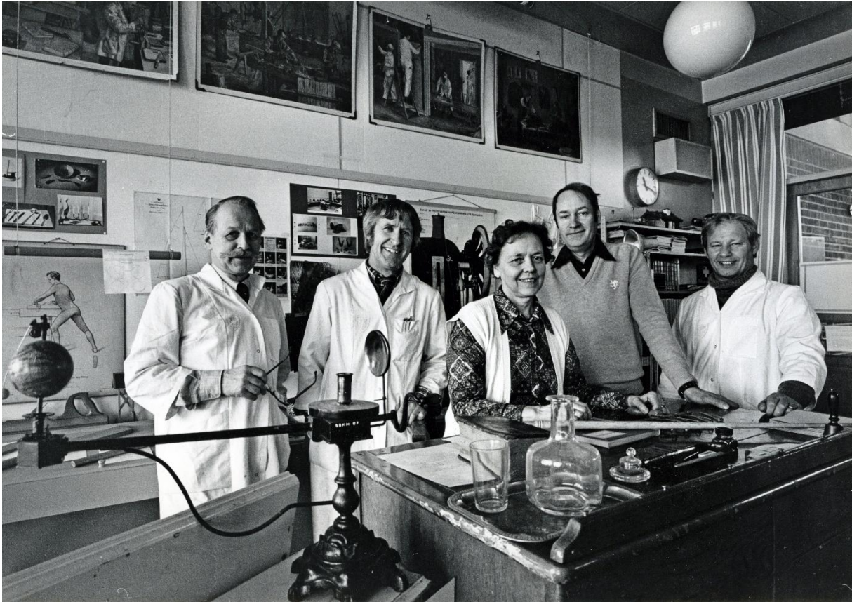
A group of teachers in science subjects, 1970s.

In order to facilitate a merger, the Swedish Teachers' Union has taken a first step by requesting withdrawal from TCO, Tjänstemännens Centralorganisation (the Confederation of Professional Employees) in December 2020. In September 2021 an extra congress of the union applied for membership in Saco, Sveriges Akademikers Centralorganisation (the Confederation of Professional Associations). Thus, the Teachers' Union complied with LR's firm demand for a Saco affiliation of a new teachers' union. The fact that academic identity is fundamental to LR's members is underlined in the LR study on a new teacher organization published in March 2021. Up to the September 2021 congress of the Teachers' Union, however, all options were still open: affiliation to TCO or to Saco or outside both. The union