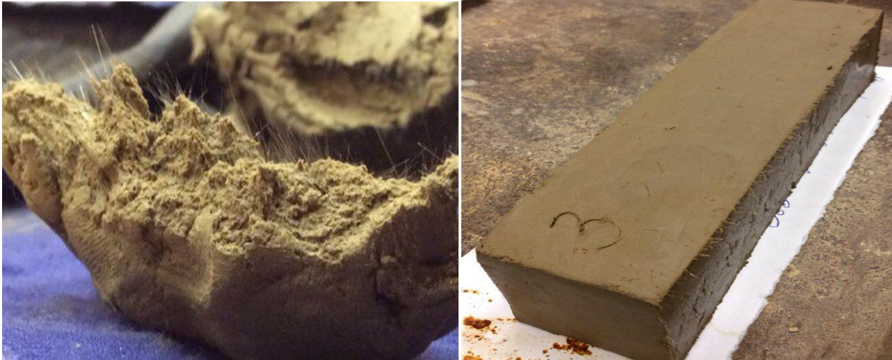
Picture 1. Clay mass with dispersed reinforcement

the mixture and the test results are presented in table 5.