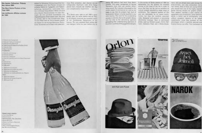
Fig. 5 "Die besten Schweizer Plakate des Jahres 1964," in Gebrauchsgrafik , 36, no. 6 (June 1965), pp. 30–31.