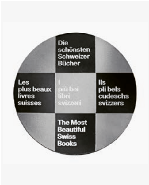
Fig.1 Giliane Cachin, sticker celebrating books awarded in the Most Beautiful Swiss Books competition, 2019, Switzerland.