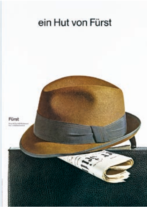
Fig. 4 E+U Hiestand, "Ein Hut von Fürst," 1964, offset, 128 x 90 cm, Museum für Gestaltung Zürich. This poster was declared Best Swiss Poster of the year 1964.