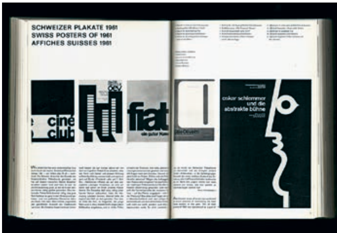
Fig. 3 "Schweizer Plakate 1961," in Gebrauchsgrafik , 33, no. 5 (May 1962), pp. 4–5.