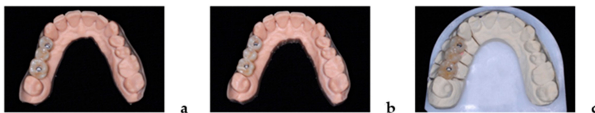
Figure 3. Set-up for cross-mounting displaying dental model situations with inserted iFDPs representing on study patient with 3D-printed implant models for Test-1 (a) and Test-2 (b), as well as gypsum implant master cast for Control (c).