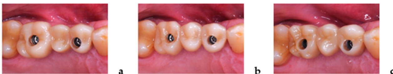
Figure 2. Clinical try-in/delivery of the iFDPs for Test-1 (a), Test-2 (b), and Control (c).