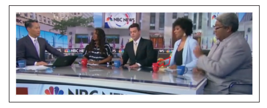
Figure 2b. Zerlina retracts her hand.