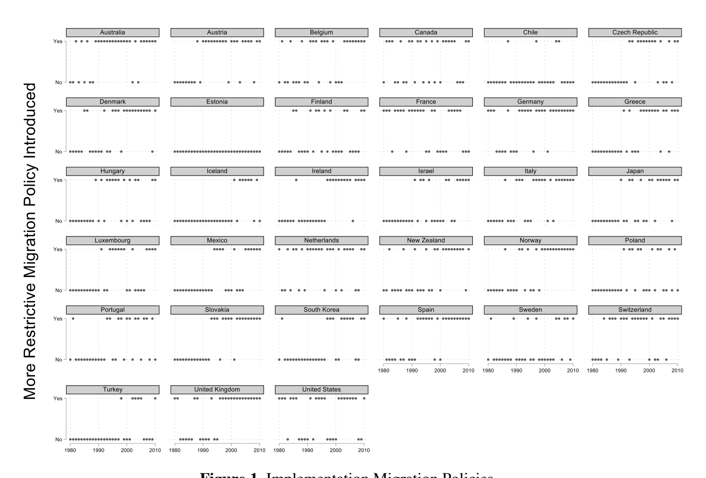
Figure 1. Implementation Migration Policies

control on migrants at the border or within the territory. For the purpose of our analysis, we opt for a dichotomous coding that receives the value of 1 if at least one, more restrictive immigration policy measure has been implemented in a given country-year (0 otherwise). The coding of migration policies' restrictiveness is difficult due to complex coding criteria. Aggregating and recoding the implementation of more restrictive migration policy into a binary variable has the advantage to mitigate this issue by reducing the risk of coding error. That said, the appendix considers alternative specifications.