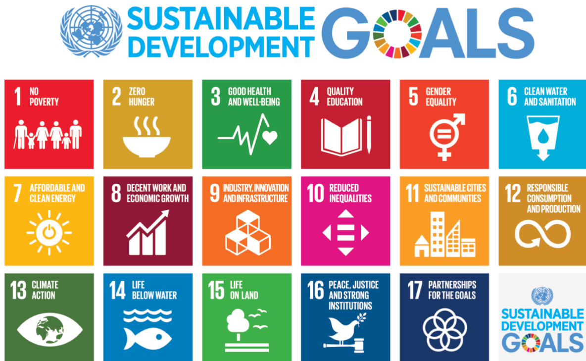
Figure 1. United Nations Sustainable Development Goals.

another. As a result, despite their numerical designations, they are not mutually exclusive of one another, rank-ordered, or framed as trade-offs. For example, SDGs such as the ending of poverty (SDG #1) and climate change remediation (SDG #13) go hand-in-hand (United Nations 2019). Amongst ending poverty and climate change action, there are goals such as ‘affordable and clean energy’ (SDG #7), ‘industry, innovation and infrastructure’ (SDG #9), and ‘sustainable cities and communities’ (SDG #11) just to name a few.