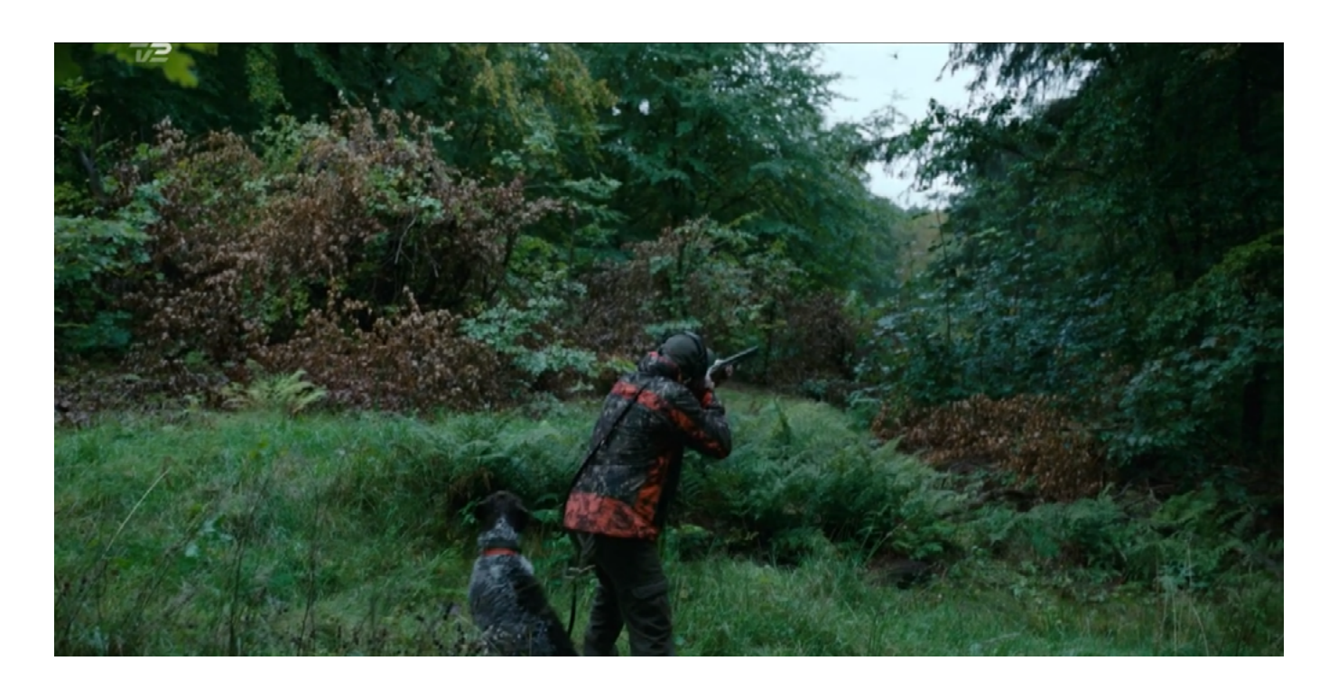
FIG. 2. THE INVESTIGATION: MIMICKING CAMERA ANGLE IN COMPUTER GAMES.

THE KIM WALL MURDER SERIALIZED: ETHICS & AESTHETICS IN HIGH-PROFILE TRUE CRIME