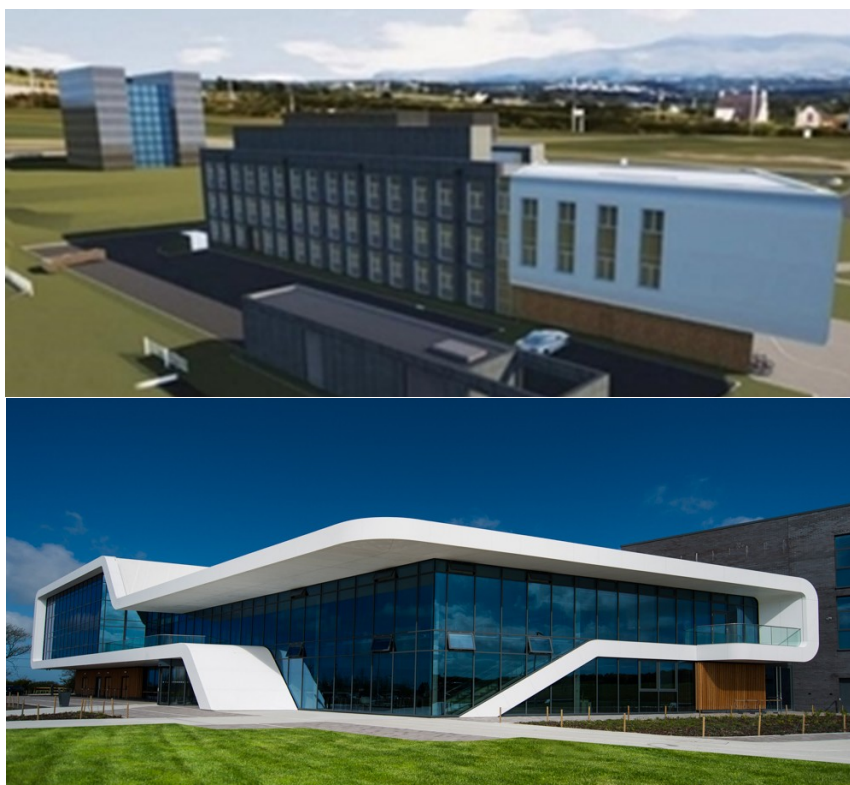
Figure 1: [Upper] Vision of M-SParc from West with NTHF building in background [Lower] Front view of M-SParc main building as it stands today

The aim is to boost the UK's nuclear new build programme as well as the development of Small Modular Reactor (SMR) and Advanced Modular Reactor (AMR) technology*, which implies that NTHF needs to provide a long-term platform that can cater for testing the Thermal-Hydraulic (T/H) properties of any reactor variant being developed for deployment in the UK – or for potential collaboration partners. While specific coolant technology selections are still to be determined, most likely testing capability should be prepared for Light Water Reactor (LWR) applications, i.e. BWR and PWR both for SMR and conventional plant implementation; Molten Salt Reactors (MSR); Fast Reactors (FR) cooled by sodium or lead; and High Temperature Reactors (HTR). Planning needs to incorporate technologies as they are being decided for implementation, including prioritisation when to start operating each coolant technology. A step-wise approach will help avoid commissioning and resourcing bottlenecks.