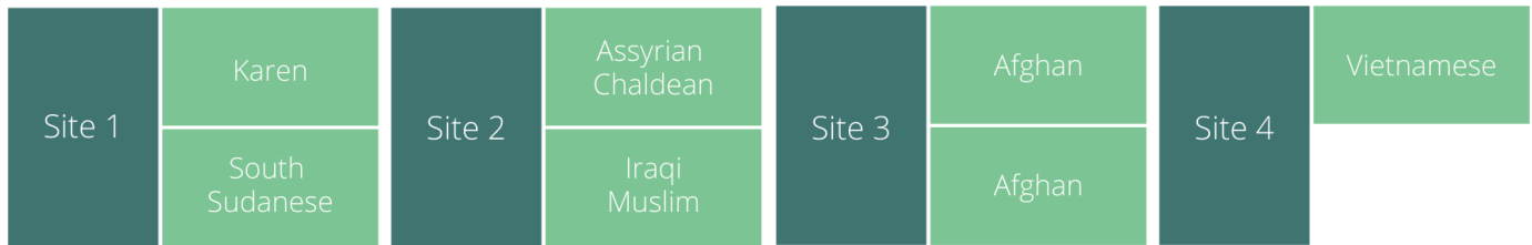
Figure 3 Planned sites for Group Pregnancy Care.

We will categorise women according to whether they are Australian born or born overseas in an English-speaking country or non-English-speaking country. In addition, we will identify all women from the cultural backgrounds of women participating in GPC, identified by county of birth and language spoken. Women enrolled in GPC will be identified in the BOS by a code in the data set.