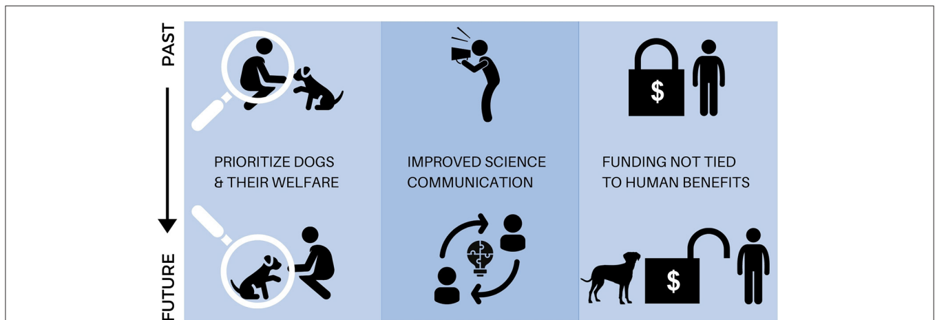
FIGURE 2 | Visual summary of the key issues identified in this Perspective . A sustainable future in canine science will require (1) research approaches that prioritize and monitor the welfare of dogs, (2) improved science communication to avoid incorrect reporting of study results, and to translate research findings to meaningful change in practices relating to dogs, and (3) availability of research funding that is not tied exclusively to studying the possible benefits of dogs for humans.

includes adjusting canine research and training methods to acknowledge the sentience of dogs, and the importance of the affective experience for dogs in both research and community settings (8–11). The discipline of animal welfare science has progressed rapidly over the last two decades, and we have many animal-based, welfare-outcome measures available to us (6, 11). Ensuring the well-being of the dogs we study will be as critical to ongoing social license to operate (i.e., community approval) for canine science as it is for working dog interests (12). Being transparent about the issues of animal consent and vulnerability, as well as offering animals agency with regard to their participation in science are valuable suggestions offered within this special issue. We encourage our colleagues to not just consider this paradigm shift, but to effect it through prioritizing and representing the dog's perspective and welfare in their research.