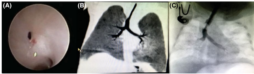
FIGURE 1 A, Bronchoscope image of the right main bronchus, demonstrating the pinhole size of the bronchus intermedius. B, CT-scan image of the circumferential narrowing of bronchus intermedius just below the opening of the right upper lobe. C, Contrast study under fluoroscopy confirming the narrowing