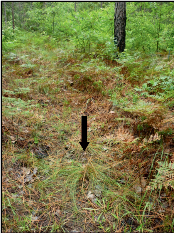
FIG. 3.—Wiregrass ( Aristida beyrichiana ) seedlings in the plowline

wiregrass plot did have appreciable woody cover in the herbaceous and shrub layers, indicating that woody plants had begun to establish but perhaps more recently than in the adjacent plots without wiregrass. In addition to the influence of wiregrass on fire behavior (Fill et al. , 2016), our results suggest another potential keystone property of wiregrass, that of low invasibility especially during fire-free