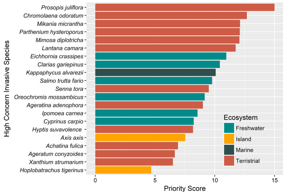
Fig. 2 Priority score of High Concern Invasive Species (HiCIS) in terrestrial, freshwater, marine and island ecosystem of India

The sea algae Kappaphycus alvarezii was the sole nominated marine invasive species by the experts attending the workshop. The algae ranked seventh in the management model; else, it ranked at the ninth amongst all the HiCIS (Table 1) (Fig. 2).