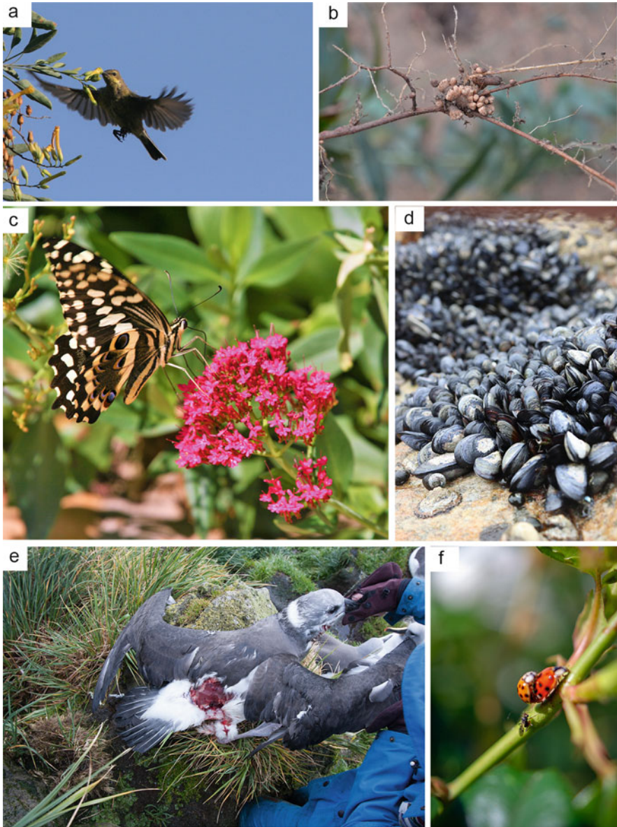
Fig. 14.3 Examples of biotic interactions during biological invasion in South Africa. (a) Hovering native Malachite Sunbird ( Nectarinia famosa ) pollinating invasive tree tobacco ( Nicotiana glauca ). (b) Root nodules formed by co-introduced nitrogen-fixing Bradyrhizobium strains on invasive Golden Wattle ( Acacia pycnantha ). (c) The native Citrus Swallowtail, Papilio demodocus , pollinating invasive Devil's Beard ( Centranthus ruber ). (d) Invasive Mediterranean Mussels ( Mytilus galloprovincialis ) showing extensive shell damage and bioerosion resulting from parasitism by possibly native endolithic bacteria. (e) A native Grey-Headed Albatross ( Thalassarche chrysostoma ) attacked by invasive House Mice on Marion Island. (f) The cosmopolitan endoparasitoid, Dinocampus coccinellae , targeting the invasive Harlequin Ladybird, Harmonia axyridis .