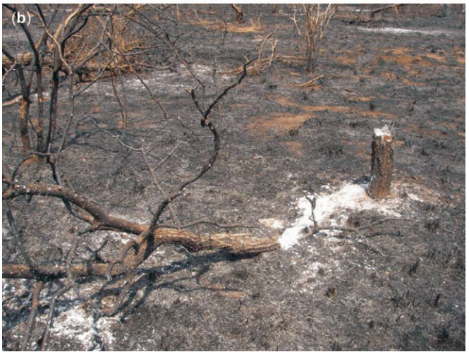
Fig. 3. The impact of elephants on woody vegetation in combination with fire in the Kruger National Park: (a) Typical elephant damage to an Acacia nigrescens tree; (b) A specimen of A. nigrescens that had been burnt off in a fire following elephant damage to the stem. Such a tree would normally survive fires of moderate or even high intensity.

the issue of interactions between fire regimes, herbivory and other factors requires better understanding if concrete recommendations about the use of fire are to be made.