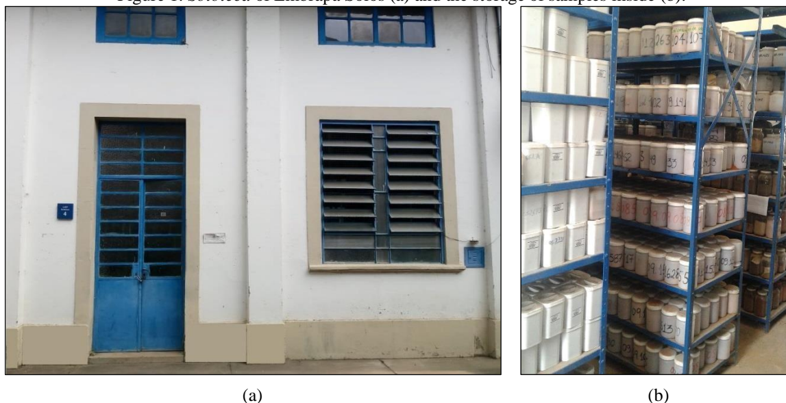
Figure 1. Soloteca of Embrapa Solos (a) and the storage of samples inside (b).

The Soloteca (Figure 1a) is installed in a well-maintained masonry structure with dimensions of 10 m long x 7.30 m wide x 5.30 m high. The environment holds 47 metal shelves of different dimensions, and its estimated maximum storage capacity is 20,000 to 25,000 samples, depending on the dimensions of the containers in which they are stored (Figure 1b).