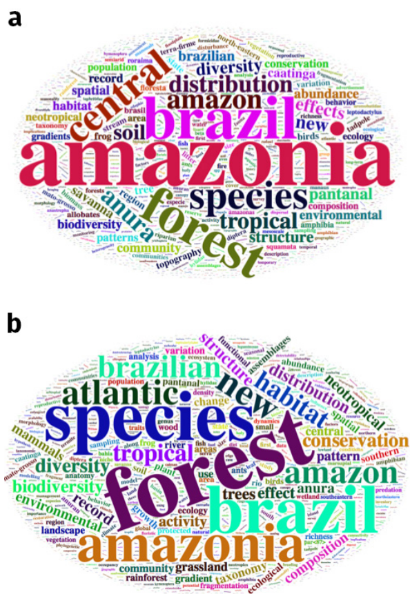
Figure 2. Word cloud using the words presented in the 1179 scientific papers titles and key-words. a) papers published to the end of 2012 and b) papers published after 2012. In both, the size of the word is proportional to its citation frequency.

Forest (17%), Caatinga (10%), Pantanal (6%), South Brazilian Grasslands (3%) and Cerrado (3%), but differences among biomes reflects to some extent biases in data reporting. Also, 2% of papers are from multiple biomes and 5% are from subjects not restricted to Brazilian biomes (e.g. methods, partnerships from Australia and Argentina, etc.). Researchers use different elements of biodiversity to test ecological hypotheses of regional and international interest. Researchers have also undertaken studies of environmental impacts of extensive infrastructure programs (Bobrowiec & Tavares 2017), fire ecology (e.g. Fadini & Lima 2012), island biogeography and