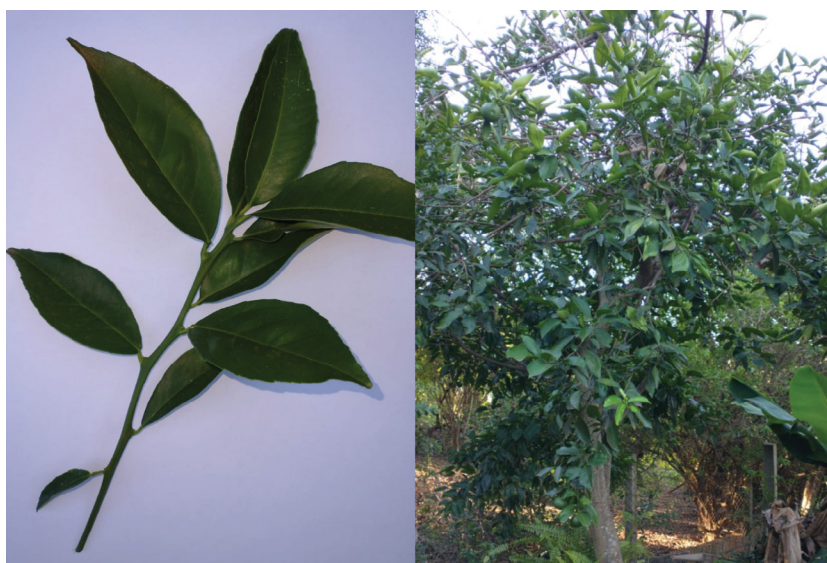
Figure 4. Citrus x sinensis (L.) Osbeck.