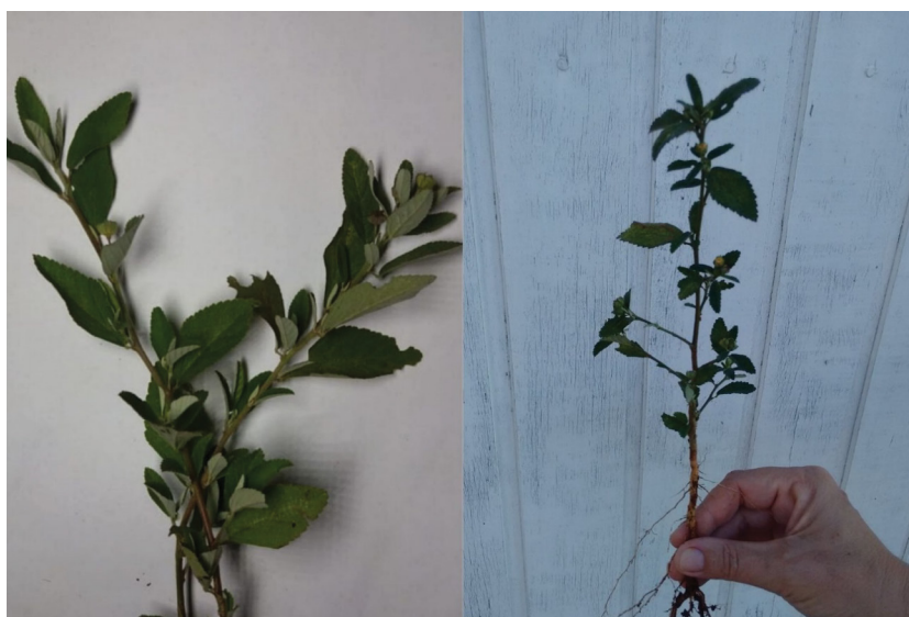
Figure 3. Sida rhombifolia L.