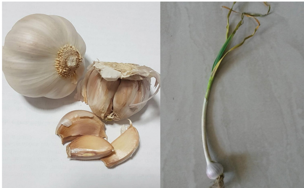
Figure 6. Allium sativum L.