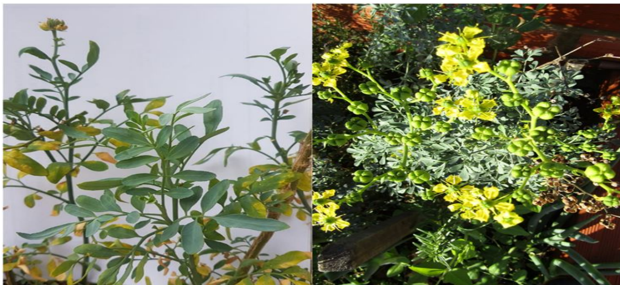
Figure 2. Ruta graveolens L.