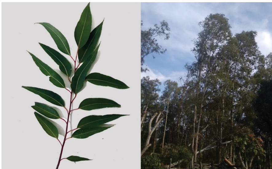
Figure 7. Eucalyptus globulus Labill.