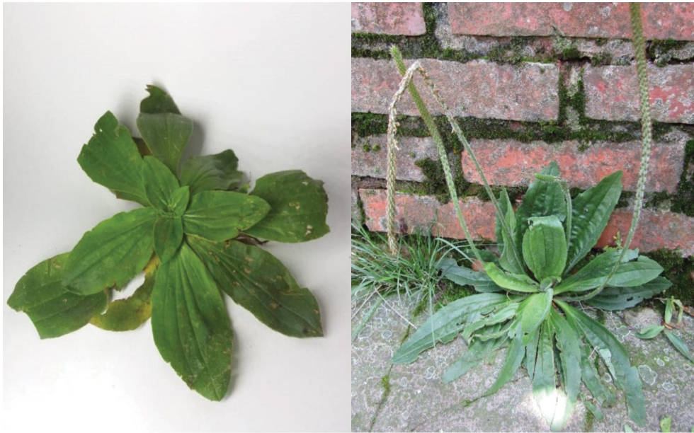
Figure 5. Plantago tomentosa Lam.