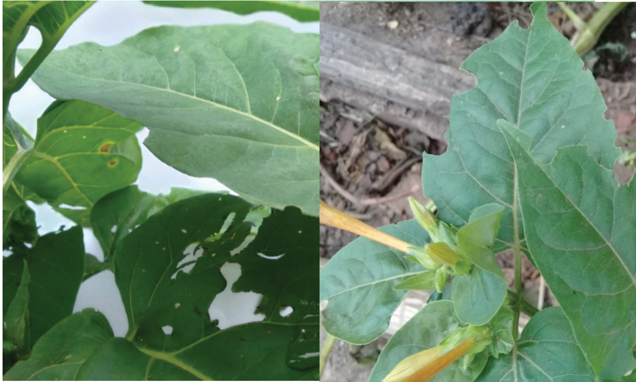
Figure 8. Mirabilis jalapa L.

In this context, this search [27] found a prevalence of 44% of insect stings in occupational accidents with children and young people who helped the family in the rural environment. This finding corroborates the importance of self-care practices in suffering situations, especially among the rural population, and reinforces the plants' importance in these situations.