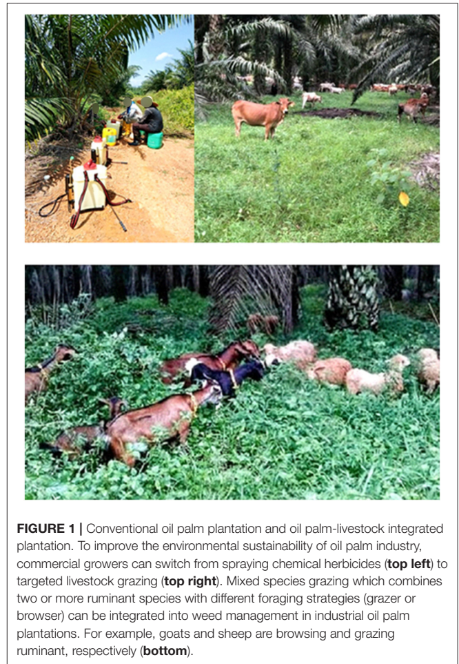
FIGURE 1 | Conventional oil palm plantation and oil palm-livestock integrated plantation. To improve the environmental sustainability of oil palm industry, commercial growers can switch from spraying chemical herbicides ( top left ) to targeted livestock grazing ( top right ). Mixed species grazing which combines two or more ruminant species with different foraging strategies (grazer or browser) can be integrated into weed management in industrial oil palm plantations. For example, goats and sheep are browsing and grazing ruminant, respectively ( bottom ).

In Malaysia, the integration of oil palm cultivation with livestock farming has been promoted by the Malaysian Palm Oil Board (MPOB) since 2000. The integration programme is