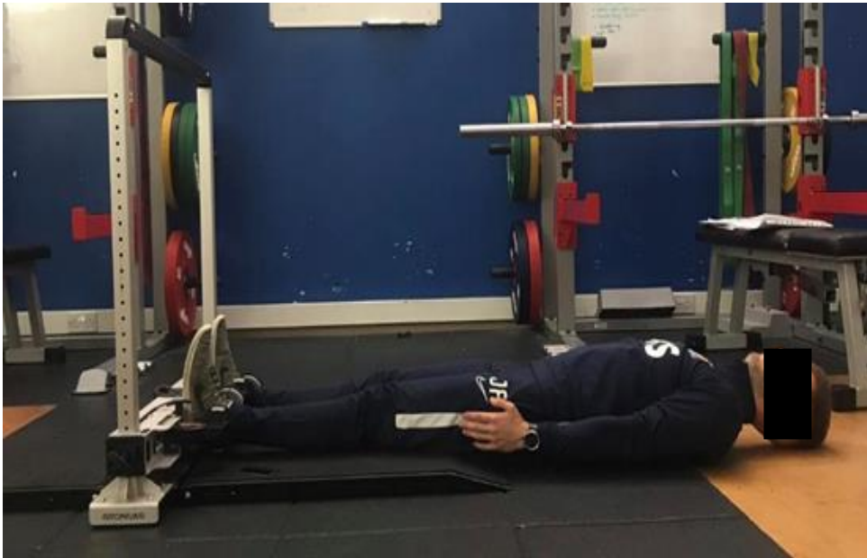
Figure 2a. Long lever testing position using the Groinbar.