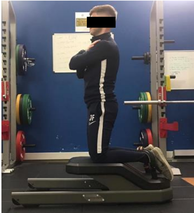
Figure 1a. Start position for Nordic hamstring curl using the Nordbord.