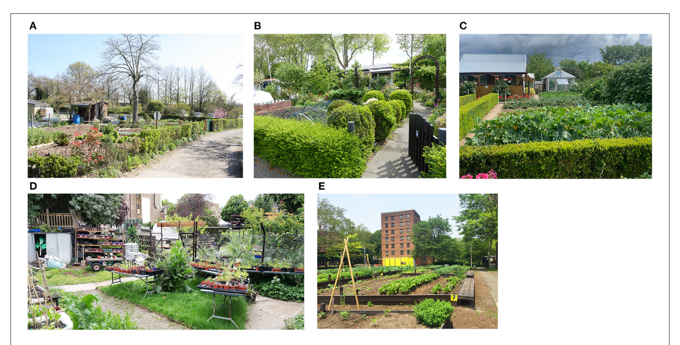
FIGURE 2 | Photographs to show examples of gardens included in the study. (A) Allotment garden, France. (B) Allotment garden, Germany. (C) Allotment garden, Poland. (D) Community garden, UK. (E) Urban farm, USA.

and policies to reduce its spread were initially implemented. The questionnaire investigated the impact of COVID-19 on the farms and gardens in terms of: (1) accessibility and service provision; (2) changes in operational arrangements; (3) impacts on production; and (4) future outlook. Moreover, the survey had an open-ended question that invited insights on related issues that gardeners believed to be relevant and important.