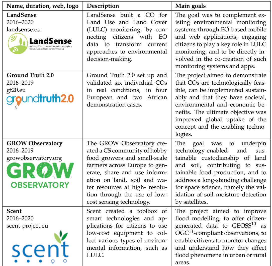
Table 2. Overview of four CO projects funded under Horizon 2020 topic SC5-17-2015.

WeObserve initially identified three key challenges to be systematically addressed in order to facilitate the mainstreaming of COs. They emerged from early discussions sharing the project experiences of the four CO projects and were selected to provide a framework for reflecting on these experiences in greater depth. No comprehensive literature review was done at that time. These three challenges are: