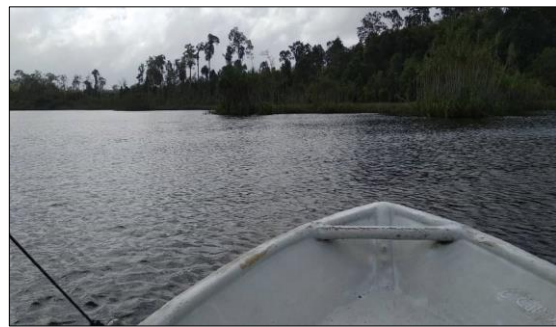
Figure 2. Jemberau River