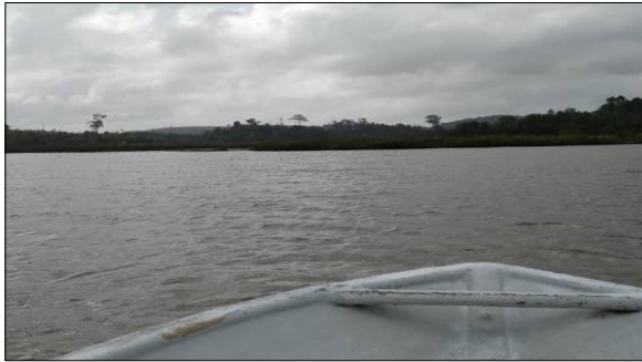
Figure 1. Melai River

Figure 1 to Figure 4 shows the view of every station which is Station 1 is Melai River, Station 2 is Jemberau River, Station 3 are Jerangking River and Station 4 are Gumum River. The view of all stations had been taken around Tasik Chini. By using a boat, the process of taking water sample at Tasik Chini become easier.