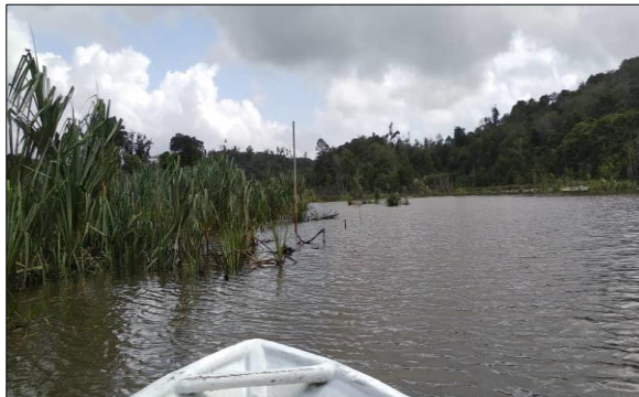
Figure 3. Jerangking River