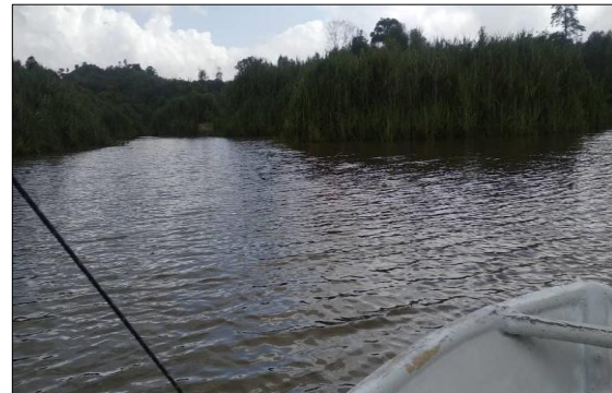
Figure 4. Gumum River

The lake serves to refill underground water, affect the water quality of the groundwater catchment, and maintain the biodiversity and habitat of the area. Dam, reservoirs and lakes are important in the conservation of basic national resource-water [12]. The two largest freshwater lakes in Malaysia which are Tasik Chini and Tasik Bera are located on the same river basin known as Pahang River Basin.