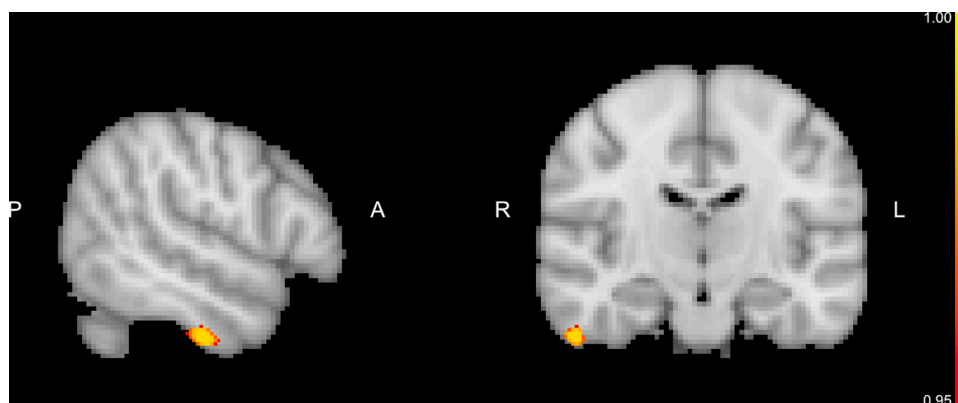
Fig. 1. The result of the gray matter asymmetry analysis. A significant correlation was found between the AI values of the inferior temporal gyrus and the HDRS scores. MNI152 standard space coordinates of the slices for the significant cluster are ( x = 18, y = 55, z = 17 ). The color bar represents (1 - p) values. (ITG: inferior temporal gyrus, HDRS: Hamilton Depression Rating Scale).

The ITG has previously been reported to show an asymmetric reduction of gray matter volume (Schmaal et al., 2017), especially in medication naïve (Guo et al., 2014a; Gray et al., 2020) and first-episode