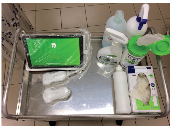
Figure 1. The worktable with the hand-held ultrasound device and the auxiliary tools

Between the two possible positions of the ultrasound probe in relation to the ribs, longitudinal (perpendicular) and transversal (parallel), the latter was our preferred approach. The chest wall was divided into 4 regions on both sides by 5 anatomical lines (parasternal, anterior and posterior axillary, scapular and paravertebral). Every region was further divided into an upper and a lower area (Fig. 2). Although the posterior chest wall (areas 7 and 8 on both sides) was not always accessible for examination as in the case of mechanically ventilated patients, we always tried to visualize this region (by tilting the patient on the