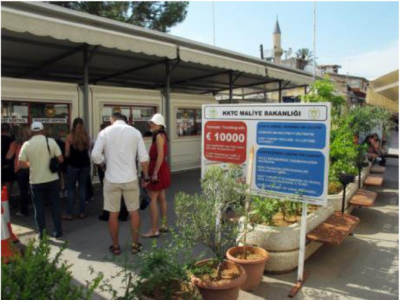
A border crossing on Ledra Street, which separates the Greek Cypriot and Turkish Cypriot parts of Nicosia.