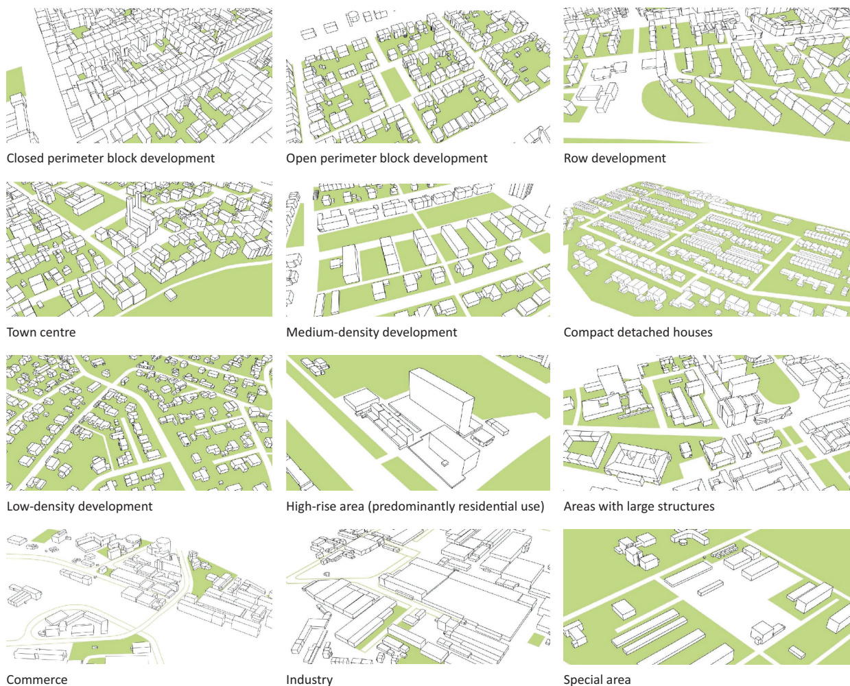
Figure 2. Major urban structure types in Karlsruhe.