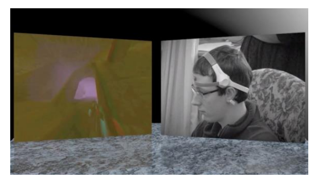
Figure 3: Quake Delirium EEG uses a NeuroSky MindWave headset to control graphical parameters of a modified video game

Recently this project was updated to create Quake Delirium EEG , a version of the system which substitutes the automation of certain colour parameters for real-time control signals provided by the NeuroSky MindWave headset, in a similar manner to Psych Dome . The project thereby explores the concept of user interactivity in an early biofeedback driven 'ASC Simulation'.