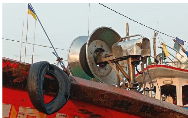
Fig.2. Hydraulic power block fitted to a trawler for operating the knotted monofilament gear

There are a number of submerged rocky patches, knolls, reefs and seamounts off Karnataka Coast between 12° N-14° N and 71° E -72° E and the largest of these seamounts, 'Manchappara (Bassas de Pedro Bank)' is located around 120 nmi off Mangalore and extends from Kasargode in the south to the Coondapur in the north (Fig.3). This is one among the 5 submerged banks which comes under the Union Territory of Lakshadweep. The knotted monofilament