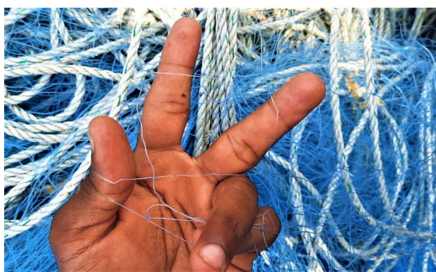
Fig.1 The knotted monofilament net used by fishers of coastal Karnataka

The monofilament (1.8 mm diameter) knotted mesh panel has 200 mm mesh size (knot to knot). The standard size of the gear panel has a width of 20 m and length of 3000 m or more. The total length of the gear varies from 3-4 km depending on the area of operation. Such knotted panels are readily available in the market and fishers procure it as per their requirement. The monofilament does not absorb water when soaked and therefore will continue to be light and maintain its original weight. Lead weights of 200 g are attached to the foot rope (12 mm diameter nylon rope) of the panel at an interval of 1 m. Small cork floats are attached to the head rope (10 mm diameter nylon rope) of the panel at an interval of every 10 m. This enables the net to sink to a desired