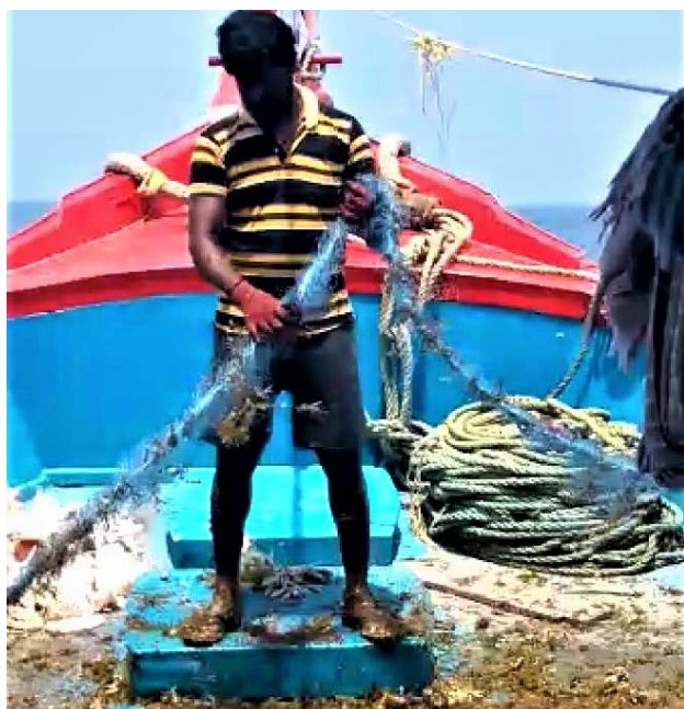
Fig.4. Monofilament gear appears as a thick rope when hauled up using the power block

The net, which settles close to the seamount/rocks as a loose sheet of meshed panel, actually entangles the fish and other species that reside and move around the reefs/ seamounts/rocky patches. When hauled up with help of the power block, the meshed panel comes up like a rope with fishes and other organisms entangled within (Fig.4). Therefore, removal of the entangled organisms and spreading of the net panel takes several hours. The