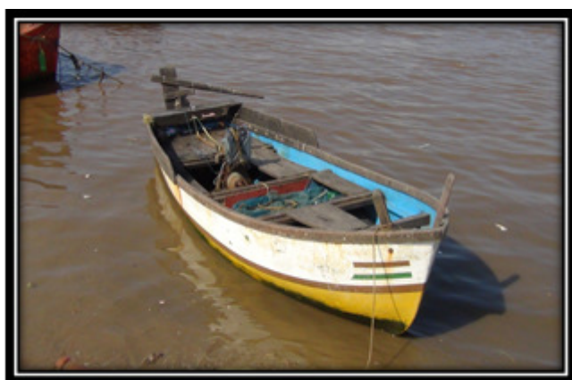
Plate 1 : Dol-netter used for dol net operation.

Dol nets were operated in the depth range less than 4 to 8 m in estuarine waters in Bhayander. Rao and Bindu (1976) reported that depth of operation of ‘kav’ was 5 to 6 m. Josekutty and Sundaram (2004) observed that dol nets off Mumbai were generally limited to the fishing grounds having depth of 10 to 30 m. As per the study conducted by Raje and Deshmukh (1989), dol nets were operated at a maximum depth of 30 to 40 m at Versova. Rajan et al (1982) reported that dol netters were operated at a depth of 30 to 40 m at Versova and at 10 to 15 m at Sassoon Docks. Hotagi et al (2007) recorded that the nets were operated at a depth of 30 to 35 m at Bassien Koliwada, Maharashtra. Depth of operation for offshore dol-netters was more unlike the restricted depth in this