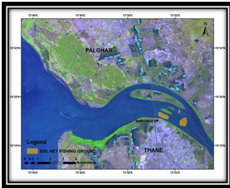
Fig. 1 : Area of dol net fishing ground.

on the type of vessel used based on the construction material such as plank built, or Fibre Reinforced Plastic (FRP) and overall length with their registration status, dimension of dol nets with respect to single day operation, number of dol nets per dol-netter information collected from the fishing ground documented. Mesh size of different kind of cod ends measured by using “Digimatic calliper”. The month-wise number of fishing days in single day fishing was observed. The distance travelled by single day dol-netters from the coast and the depth of operation details collected month-wise. Secondary data collected from the Department of fisheries, Thane, Government of Maharashtra and Maharashtra marine fisheries census, 2010 published by CMFRI, Cochin.