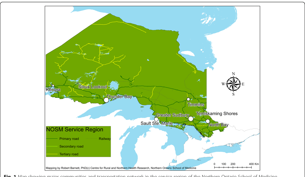
Fig. 1 Map showing major communities and transportation network in the service region of the Northern Ontario School of Medicine

Hogenbirk et al. Health Economics Review (2021) 11:20 Page 3 of 10