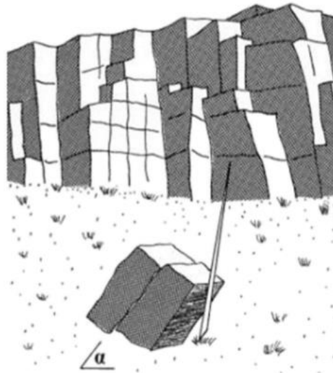
Figure 1. Development of tilt test on field [10].

In this work, the basic friction angle ( \phi_b ) and the the tilt angle ( \alpha ) are evaluated using the tilt test in the field for some lithologies that are not present in standard reference tables of values such as granodiorites, rhyolites, dacites, andesites and carbon.