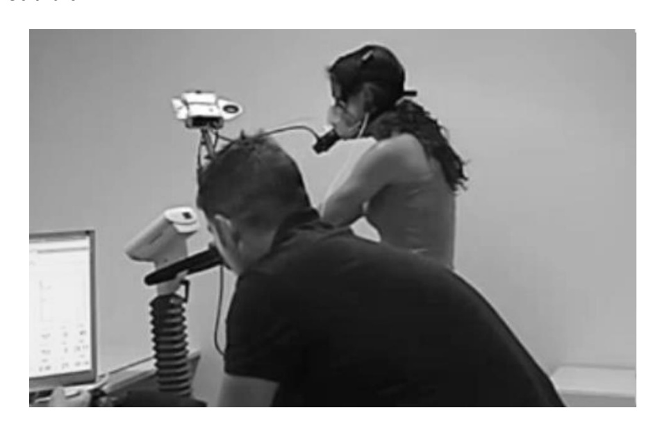
Figure 1. Participant performing submaximal incremental exercise test.

To record the heart rate (HR) during the exercise stress test, a Polar M400 heart rate monitor (Polar Electro, Finland) was used. The ventilatory parameters were measured during the submaximal incremental exercise test using a True One 2400 Metabolic measurement system (Parvo Medics, Sandy, UT) and a Jaeger Master Screen gas analyser, and a Viasprint 150 P cycle ergometer (See Figure 1). HR was coded with Polar ProTrainer 5 Software.