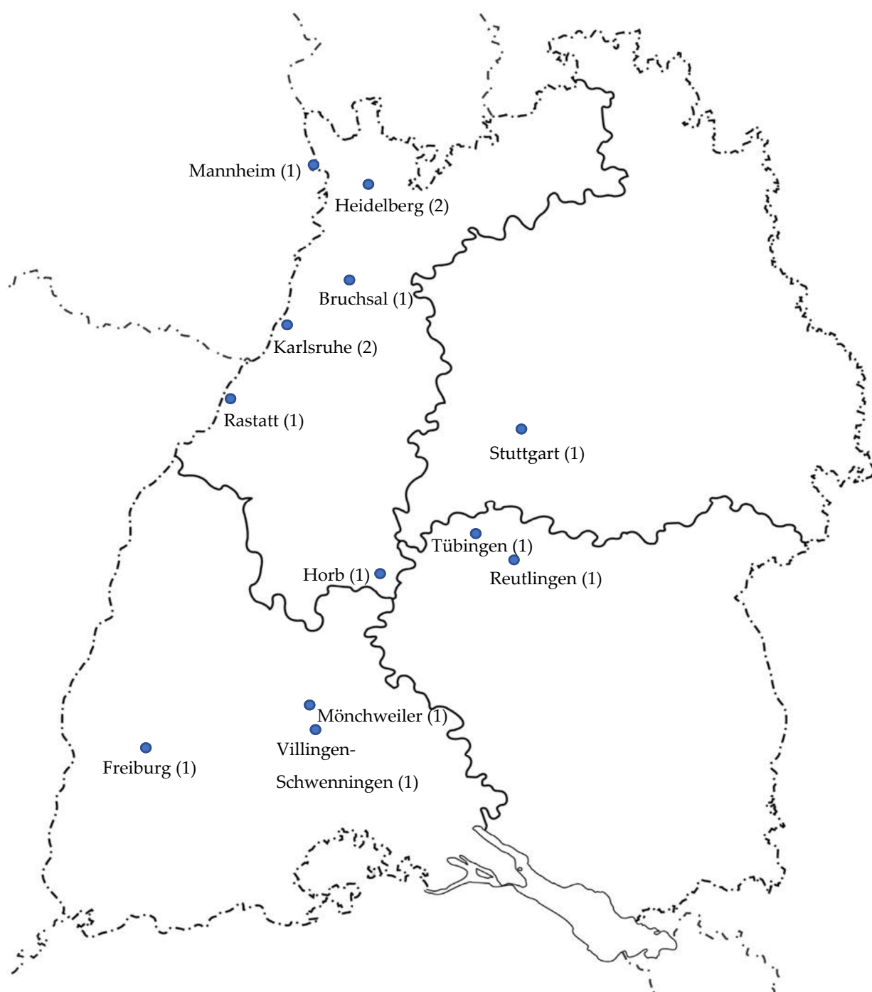
Figure 1. Study's sample points.