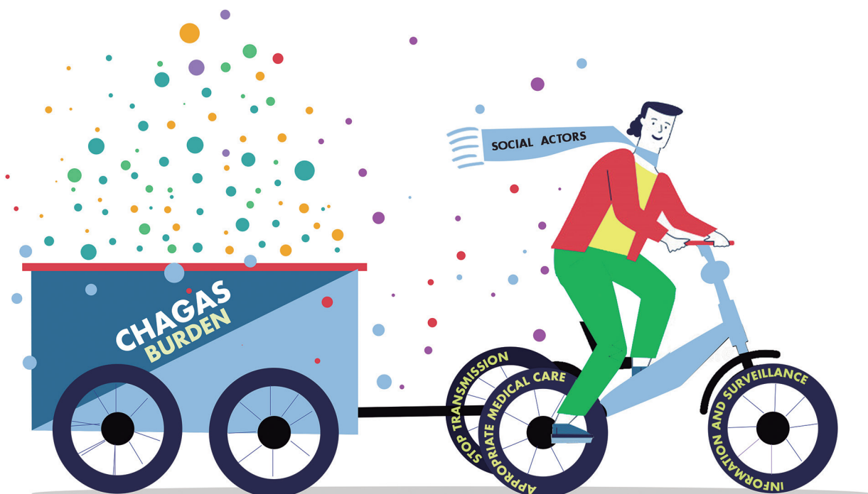
Fig 2: tricycle strategy of the World Health Organization Programme on Control of Chagas disease. (17) (Graphic adaptation: Iván Pasanau)