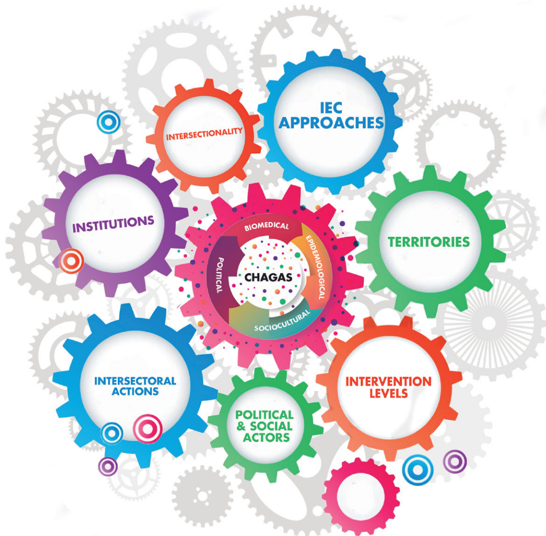
Fig. 4: interlocking gears to address the multidimensionality of Chagas (Illustration: Iván Pasanau). Each gear represents a key component to consider in a multidimensional strategy for Chagas. Key aspects of each gear are described below. IEC APPROACHES (Information, Communication and Education tools, strategies, methodologies, social media, technology), TERRITORIES (rural, urban, local, regional, national, global, borders), INTERSECTORAL ACTIONS/INSTITUTIONS (health systems -national, local, international; public administration; educational settings; universities and technical schools; media; and legislative and operative public and private institutions involved in labour, housing, migration, and the environment, NGO, macro structures), INTERSECTIONALITY (gender, sexual orientation, race / ethnicity, nationality, social class, vital cycle, physical abilities), INTERVENTION LEVELS (awareness, prevention, care, follow-up, primary and secondary systems, individual, family and community levels), POLITICAL & SOCIAL ACTORS (associations of people with Chagas, other social organisations, decision makers, educators and communicators, specialists, artists, health workers, activists).

Finally, the system of interlocking gears enables us to engage with new actors, elements, and settings, incorporating emerging aspects, such as contemplating other problems and realities affecting people's health. In this way, we can clearly visualise main future challenges: