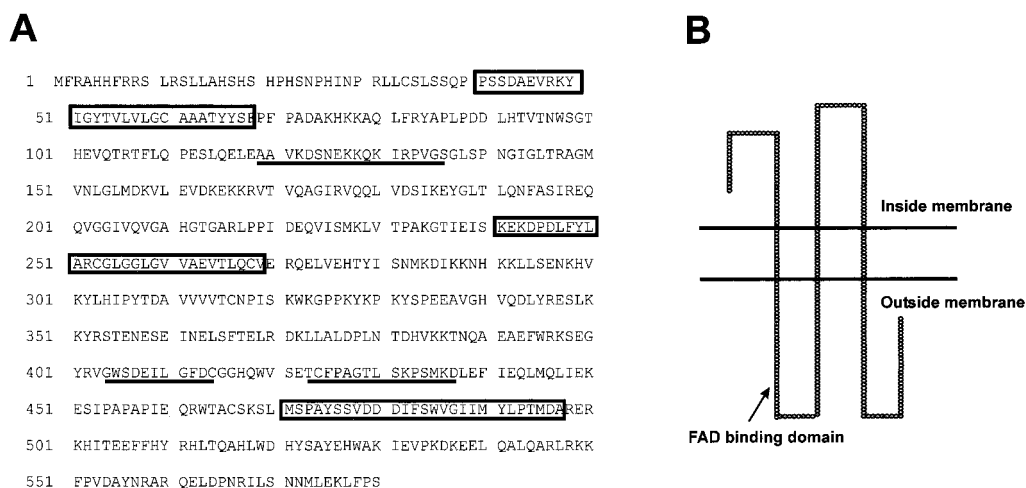
Figure 2. Predicted inner mitochondrial membrane-spanning region of GLDH. GLDH transmembrane regions and orientation were predicted using the Tmpred program. A, GLDH protein sequence from sweet potato (Imai et al., 1998). Areas included in boxes are membrane-spanning regions, while those underlined are peptides generated after digestion with a V8 protease. The Leu at position 137 indicates the normal position for the FAD-binding domain, and is located on the outside of the inner mitochondrial membrane. B, Predicted inner mitochondrial membrane-spanning region of GLDH.

partments, confirming that GLDH is absent from other sites in the plant cell. The natural electron acceptor for the microsomal GLDH form is unknown, but the involvement of other cytochromes present in microsomal fractions suggests that electron donation may not be limited to Cyt c . Microsomal GLDH may use L-gulono- \gamma -lactone as a substrate. This would explain why purified GLDH is specific for GL and does not catalyze the oxidation of L-gulono- \gamma -lactone (Ôba et al., 1995), while intact tissues can oxidize GL and L-gulono- \gamma -lactone. This was demonstrated in Arabidopsis cell suspension cultures incubated with a range of potential biosynthetic precursors of ascorbic acid (Davey et al., 1999). It is interesting that cytosolic expression of rat liver L-gulono- \gamma -lactone oxidase in potato (T. Imai, A. Kingston-Smith, and C.H. Foyer, unpublished results), lettuce, and tobacco plants results in increased ascorbate biosynthesis (Jain and Nessler, 2000). This enzyme must have access to an alternative electron acceptor, since there