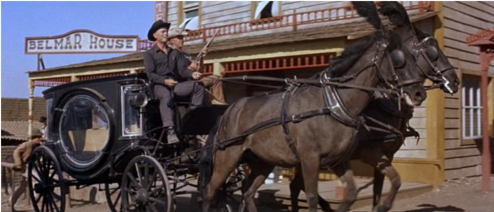
Figure 9. Chris (Yul Brynner) giving a migrant a proper burial: THE MAGNIFICENT SEVEN (USA 1960)

One intertextual film historical reference that depicts a cowboy's attempts to give a "migrant" a proper burial and ends up with a Mexican village being "saved" is John Sturge's THE MAGNIFICENT SEVEN (USA 1960). This Western introduces its protagonist Chris (Yul Brynner) when he brings a dead "migrant" to the village cemetery in a small town in the southern United States and then wields his gun in order that the stranger may receive a suitable burial despite the resistance of the white residents. He is then hired by Mexican farmers to protect their village from bandits and brought to Mexico.