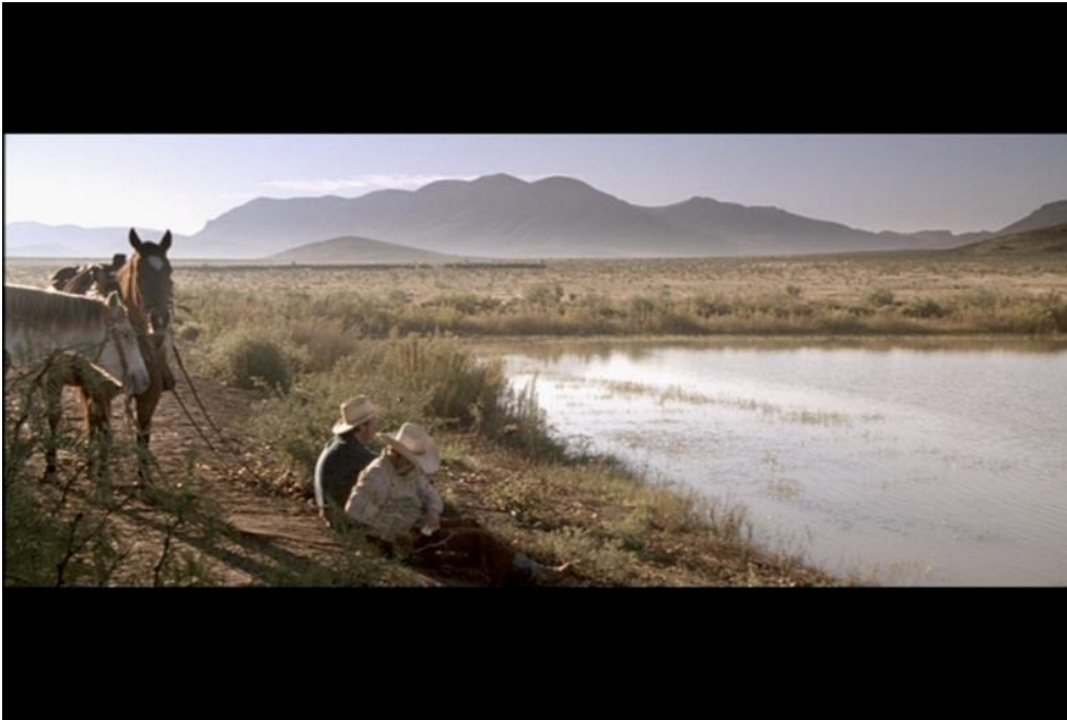
Figure 3. Melquiades's Request in Flashback