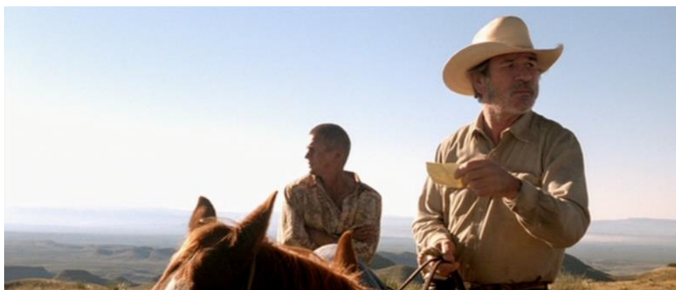
Figure 1. THE THREE BURIALS OF MELQUIADES ESTRADA (F/USA 2005)

1 Like narrative storytelling, historiography requires a medium. With this in mind, Hayden White described the process of writing a history of the nineteenth century as a poetological technique, a process that could equally be conducted via the medium of film. 2 If we follow this assumption, White's critique of the narrative nature of historiography can also be applied to the twentieth century and to film. This brings about a shift in focus away from grasping historiography in terms of literary theory (as in White) and towards a mediatization of this technique, which involves linking together different perspectives from literary, visual, and sound theory into a complex film studies approach. This entails bringing history into connection with the respective apparatuses of narration and literary history as well as those of photography and the media that have followed it, that is, the history of images and moving images, before also connecting it to the apparatus of recording sounds, voices, noises, and music: in other words, a history of sound objects.