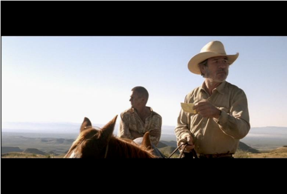
Figure 6. THE THREE BURIALS OF MELQUIADES ESTRADA (F/USA 2005)

This forms a dramatic turning point in how the film is to be understood, as, in the first part of the film in particular, the plot hinges on the fundamental elements of the map and the photograph. These objects also hold great significance when it comes to how the viewer perceives the film, given that they offer a sense of semantic and orientational security amongst all the deliberately confusing editing techniques and jumps back and forth in time. Up to this point, the hand drawn map and the Polaroid photograph have served as reliable anchors of a visual history and have also forged a connection to the reality effect of the film watching experience. Both are now revealed as being imaginary: a distancing effect that brings not just the constructed nature of the photograph and the map to the fore but also that of the film itself. This reassessment of the map and the photograph makes the film's previous sense of order collapse entirely. All that now remains is the beauty of the natural landscape that envelops the travelers, while the viewer must now search for a new interpretational model. It is only the sound track, with its musical score and animal sounds, and the sound space it constructs which is still tenable here, unlike the visual and narrative "story" which can no longer be relied on.