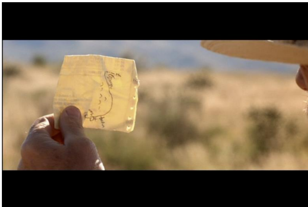
Figure 5. THE THREE BURIALS OF MELQUIADES ESTRADA (F/USA 2005)

around a series of dialogues that perform a deictic function and position themselves in opposition to what is seen and heard, such as when the numerous billboards are mentioned despite their being nothing to be seen far and wide, or in dialogues that take the form of gags that explicitly refer to the sound track and yet seem to have no greater significance than that.