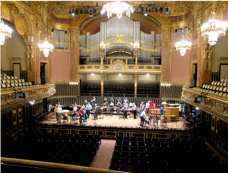
FIGURE 6.3 Franz Liszt Memorial Museum, part of the Franz Liszt Academy of Music in Hungary, an EHL site.