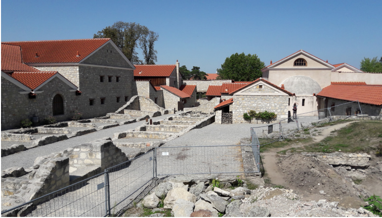
FIGURE 6.4 The Carnuntum Archaeological Park in Austria, an EHL site.

both follow the macro-level voice and contribute to it by creating contents for the EU discourse (Lähdesmäki et al. 2020). The designation process of the EHL sites exemplifies the interaction between the levels. Sites are pre-selected at the national level, designated at the EU level by an international expert panel, and finally awarded the Label by the European Commission (see Chapter 1).