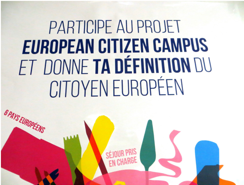
FIGURE 5.1 A poster (detail) that advertised the ECC in Strasbourg in 2014 on the wall of the student canteen where meals for the Roots lab were served.