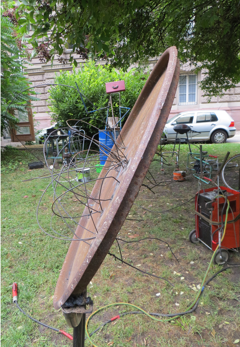
FIGURE 5.3 Roots of Europeans crisscross in an art work being made in the sculpture workshop.

presenting the project and the art exhibition based on it (Art Catalogue 2015, 53):