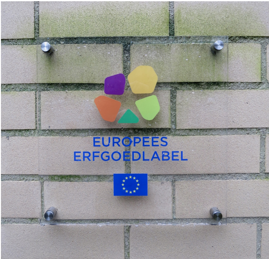
FIGURE 6.5 The EHL logo, photographed at Camp Westerbork, the Netherlands.

In the interviews, we also asked the visitors about their associations related to the EHL logo and two of its slogans ‘Europe starts here’ and ‘Europe starts with you’ (see also Lähdesmäki et al. 2020). The former is the official slogan of the EHL, which is used for presenting the EHL action at all sites, with the exception of Camp Westerbork, which uses the slogan “Europe remembers Camp Westerbork”. The slogan ‘Europe starts with you’ is found in the brochures and other promotional material informing interested heritage sites about the application aims and procedures. Both of these slogans are formulated by the Commission and used by the national coordinators of the action and the EHL practitioners at the awarded sites. The question about the slogans, thus, enabled us to explore the reception of the intertwined macro and meso-level EHL discourse at the micro level. During our interviews, most of the interviewees compared the slogans and usually preferred one to the other. Their interpretations of the slogans opened up a very interesting understanding about