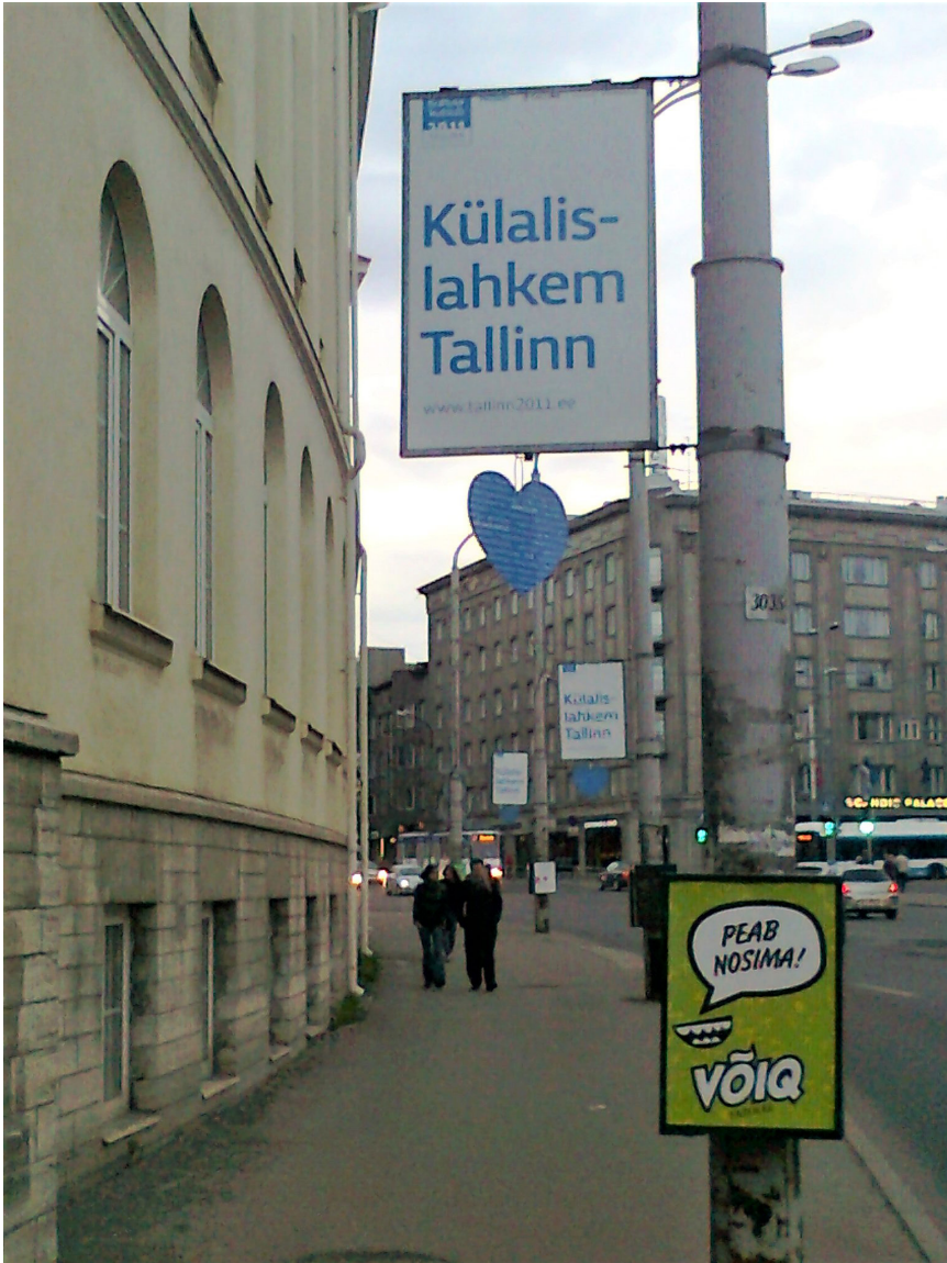
FIGURE 4.1 Sign boards with the ECOC title in a Tallinn street scene in 2011. The text on the board says 'More hospitable Tallinn'.

case ECOCs, the city centers were enlivened by foreign performers, performing groups, and audiences from different countries. The multinational nature of these events could be experienced through the multiplicity of languages used in the performances, heard among the audiences, and printed in the communication materials. The use of national flags in the events or the texts in the