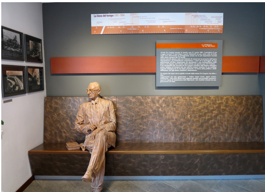
FIGURE 6.1 Alcide de Gasperi House Museum in Italy, an EHL site.

Embedded in the EU's multilevel governance, the EHL is based on an interaction between what we call the macro and meso levels of European discourse. The macro level is formed by the EU institutions and the civil servants of the European Commission who shape the EU's discourse on the EHL, and thereby on Europe, with their textual and visual materials, such as policy documents and websites. The main creators of the meso-level EHL discourse are professionals working day-to-day at the awarded EHL sites who formulate, interpret, and put into practice the 'European significance'. As our research shows, they