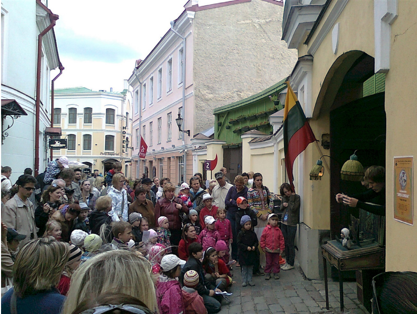
FIGURE 4.3 Outdoor performance by a Lithuanian group at the puppet theatre festival in Tallinn2011. The flag indicates the home country of the group.