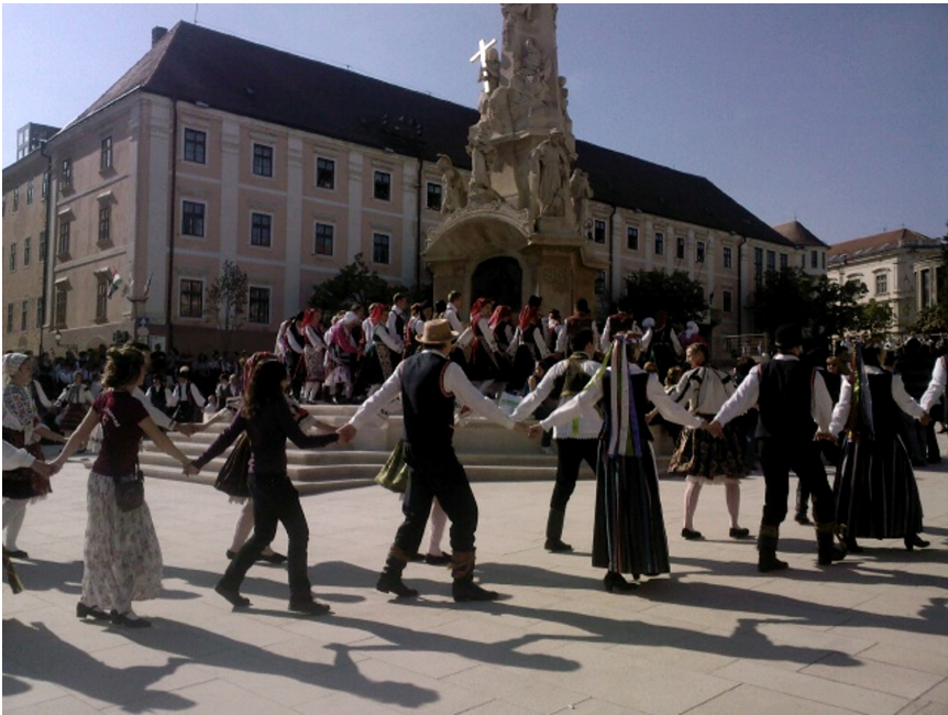
Folk dance performers dancing with the audience in Pécs, Hungary, as part of the European Capital of Culture year in 2010