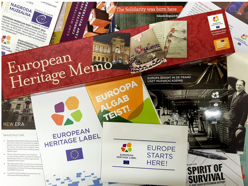
FIGURE 6.6 Collage of information brochures, flyers, and promotional material from various EHL sites and in multiple languages.

Europe based on location and/or individual disposition and participation. The simple and catchy formulations of the slogans provided a good basis for interpreting both the visitors' answers to their imaginaries of Europe and to questions directly connected with the EHL. During the process of data analysis, we realized the potential of the EHL slogans as a basis for discussing the EU's politics of belonging and decided to structure our chapter according to the 'Europe of people' and 'Europe of nations' positioned in the visitors' answers. It is important to emphasize that by analytically dividing the data, we do not intend to categorize visitors. As our data shows, interviewees gave controversial or multiple answers to the interview questions. The following sub-sections are mostly based on people's responses to each of the EHL slogans, whereas the third sub-section focuses on answers given about Europe throughout the interviews.