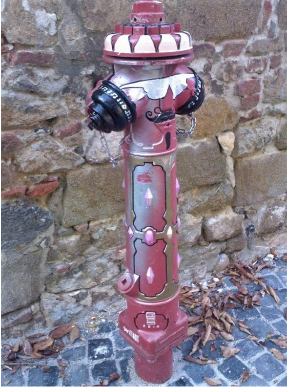
FIGURE 4.6 Painted water post with the ECOC logo in Pécs2010.

of view of the 'European'. The construction and renovation projects in the city were linked to Europe and the EU through signs indicating that the EU was a project funder. The renovations of buildings and public spaces in the center turned Pécs into a modern 'European city' like many others, with medieval and classical architectural layers and modern urban furniture. In general, the construction of (cultural) infrastructure, renovation of buildings, and transformation of urban spaces are probably the most influential components of the ECOC year. They not only change the city space but also impact on visitors' and inhabitants' notions of the city, as well as their movement, activities, and cultural behavior in the city.