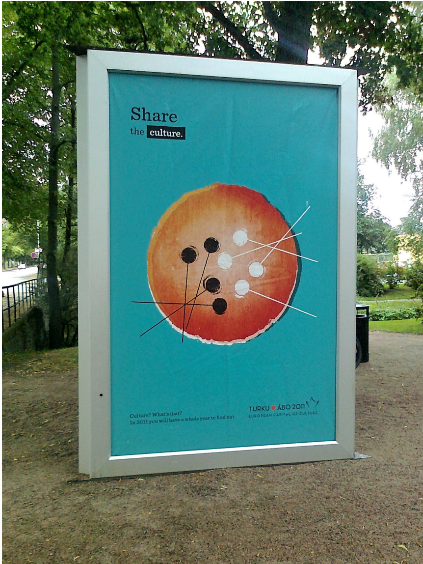
FIGURE 4.2 In Turku, the ECOC title was advertised in the city center through large sign boards that played with the logo of Turku2011.