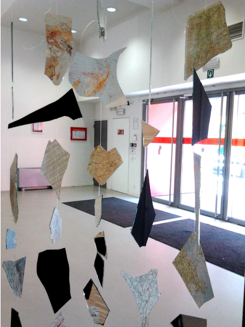
FIGURE 5.4 Shifting geographies of Europe in the ECC art exhibition at the dissemination conference in Antwerp.