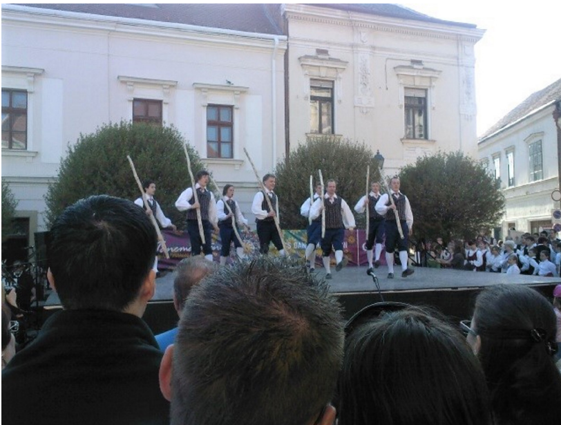
FIGURE 4.4 Finnish performers wearing folk costumes at the folk dance festival in Pécs2010.