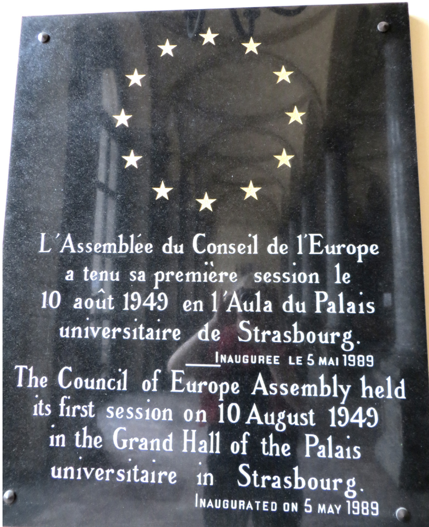
FIGURE 5.2 The plaque in the hall of the main building of the University of Strasbourg commemorates the first session of the Assembly of the Council of Europe.

and multicultural border region between France and Germany played a significant role in the life and art of Ungerer, and he strove to improve Franco-German relations. Hence, the museum and the film offered opportunities to reflect on both roots and citizenship and their context embedded in Europe and its history. There was no time scheduled for discussing the museum and the film in the laboratory programme. Despite this, one of the participants connected the topic of roots and Tomi Ungerer in a comment published in the catalogue