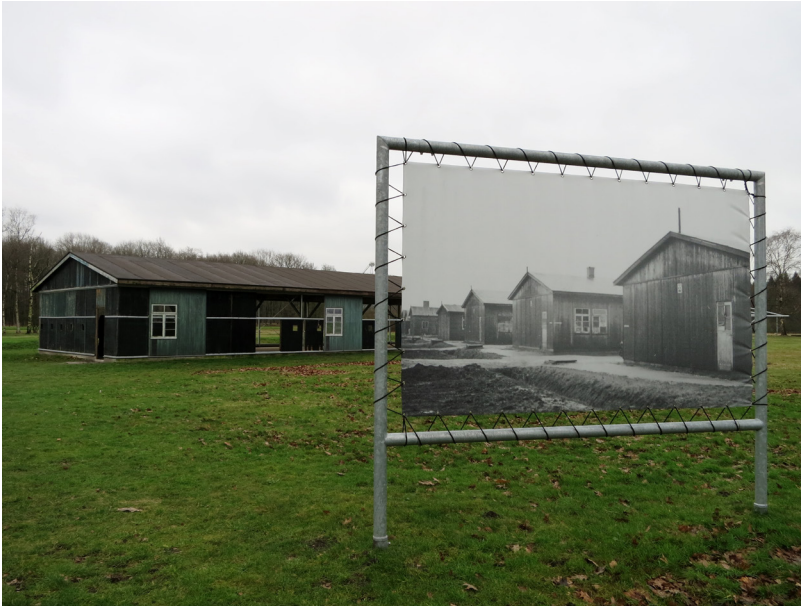
FIGURE 6.2 Camp Westerbork in the Netherlands, an EHL site.