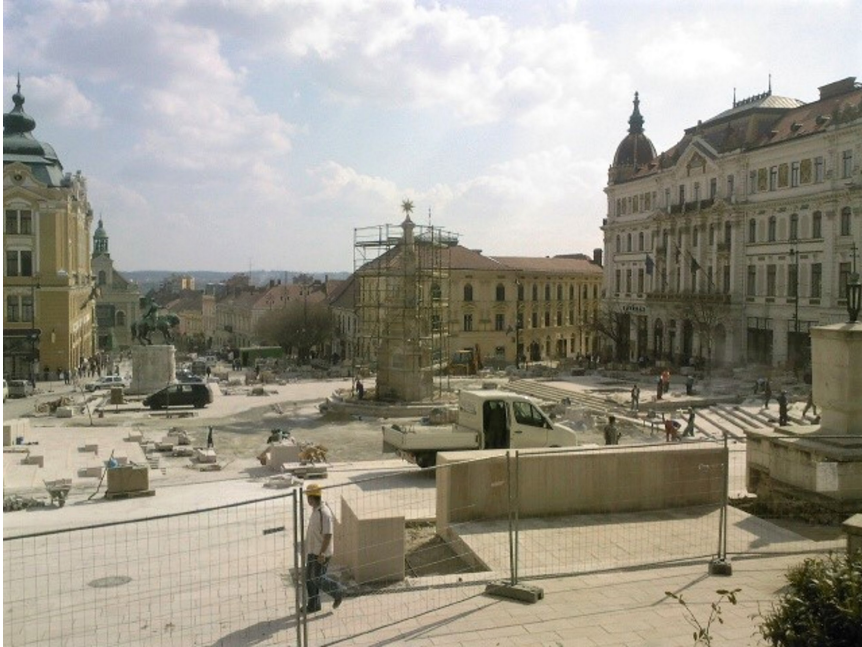
FIGURE 4.7 Renovating and constructing Széchenyi square in Pécs during its ECOC year.

repetitions, and reminders of other ECOCs. All cities seem to come up with very similar ideas and seek to emphasize the same ideals in their promotion of the European dimension. Some of the photos taken during the fieldwork are therefore so similar that their locations are difficult to tell based on the image alone. This similarity can be perceived as stemming from the nature of the ECOC action based on a competition and a set of selection criteria (Lähdesmäki 2014b). All the candidates seek to fit their applications, plans, and programmes into this framework, as well as to find and utilize the most recent trends in participatory culture, cultural regeneration, and revitalization of urban space. As a result, the ECOC action has succeeded in constructing a year-long urban event that we find very ‘European’ in a sense that its European dimension is constantly discussed, negotiated, debated, manifested, and, thus, constructed in it.