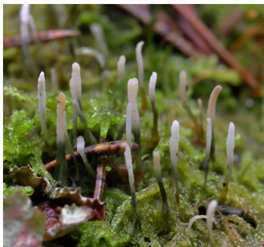
Fig. 7. Eocronartium muscicola in Kuhmo (JJ 1096).

SPECIMEN EXAMINED: Ostrobothnia kajanensis, Kuhmo, Jylkynsalo, UCS 7103327: 3665581, on a