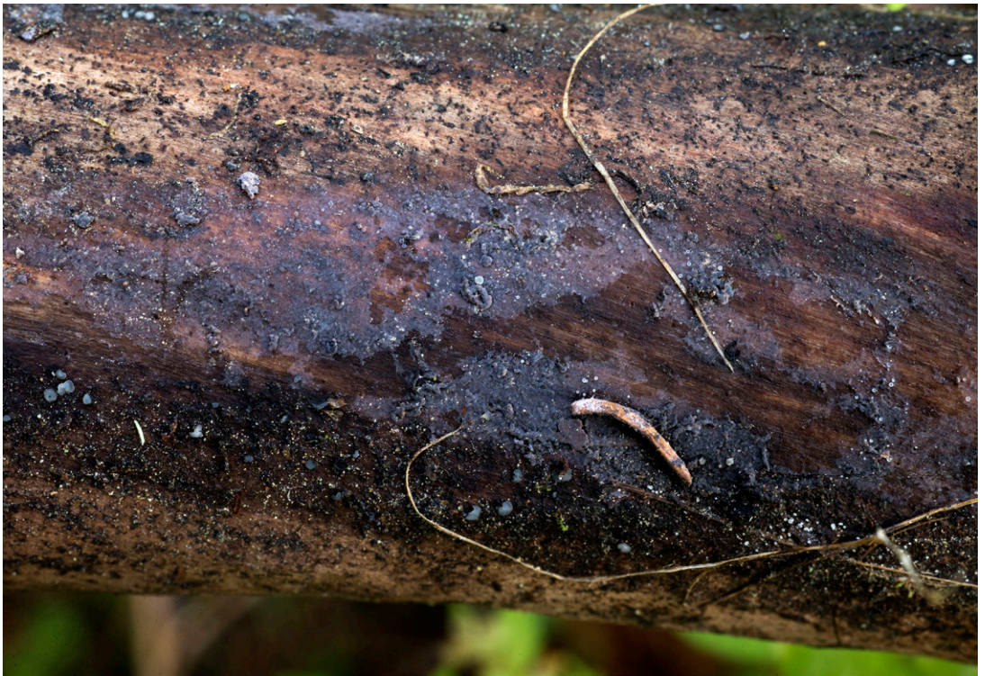
Fig. 21. Tulasnella aff. pallida in Sotkamo (TH 2018143).