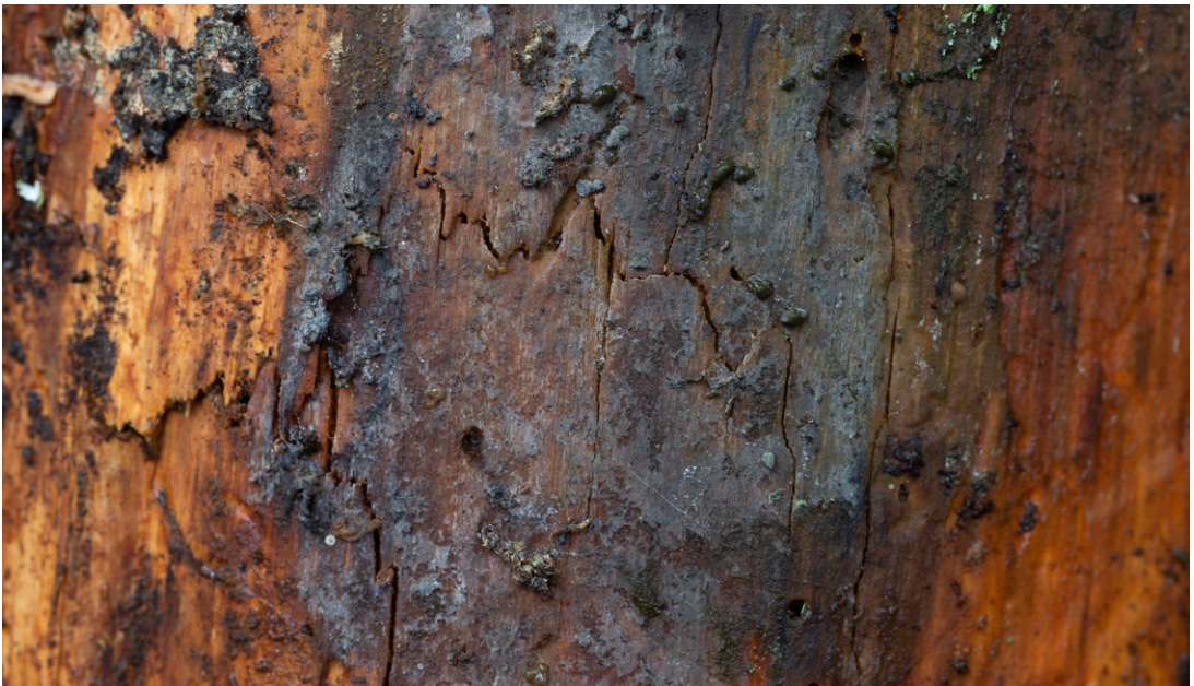
Fig. 12. Paulliticium pearsonii in Sotkamo (TH 2019009).

SPECIMEN EXAMINED: Ostrobothnia ultima, Kemijärvi, Pyhätunturi National Park, Isonkurunkangas, UCS 7435:3510, on a whole fallen trunk of Pinus sylvestris (diam. 20 cm, decay stage 4), 2 Aug 2007, leg. PK 1931 (OULU), det. MK.