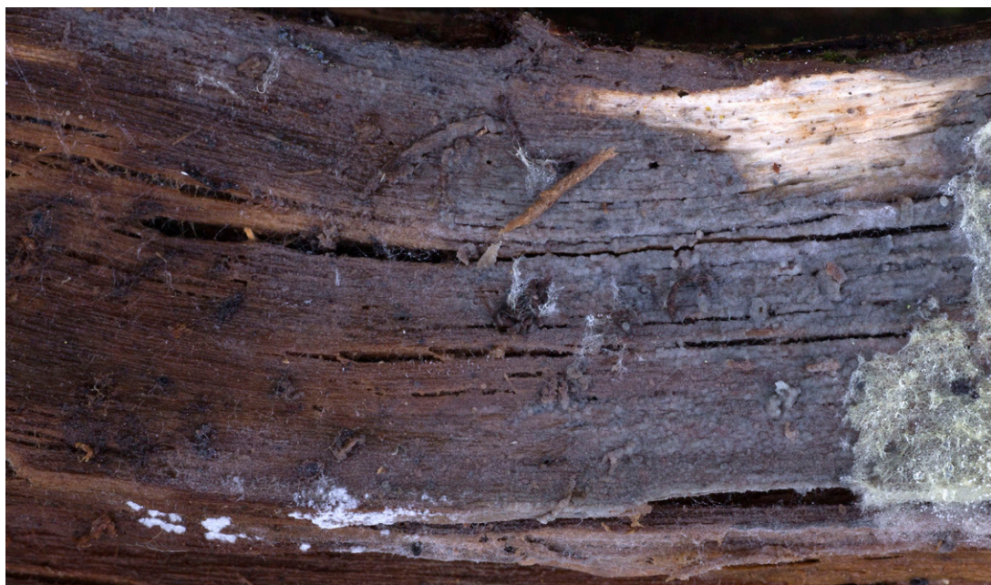
Fig. 8. Helicogloea aquilonia in Sotkamo (TH 2018088).