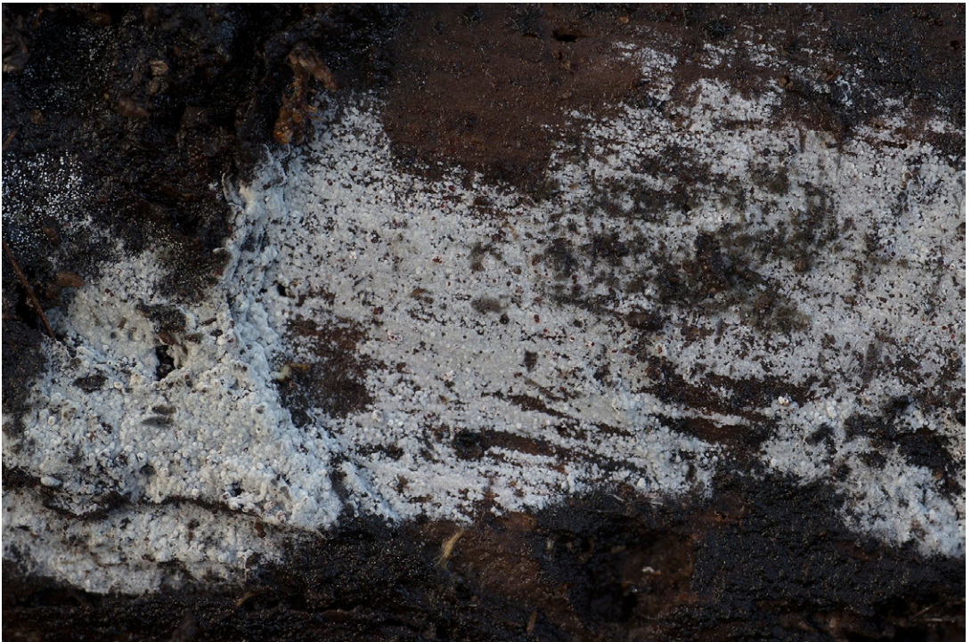
Fig. 11. Membranomyces delectabilis in Pori (TH 2019004).