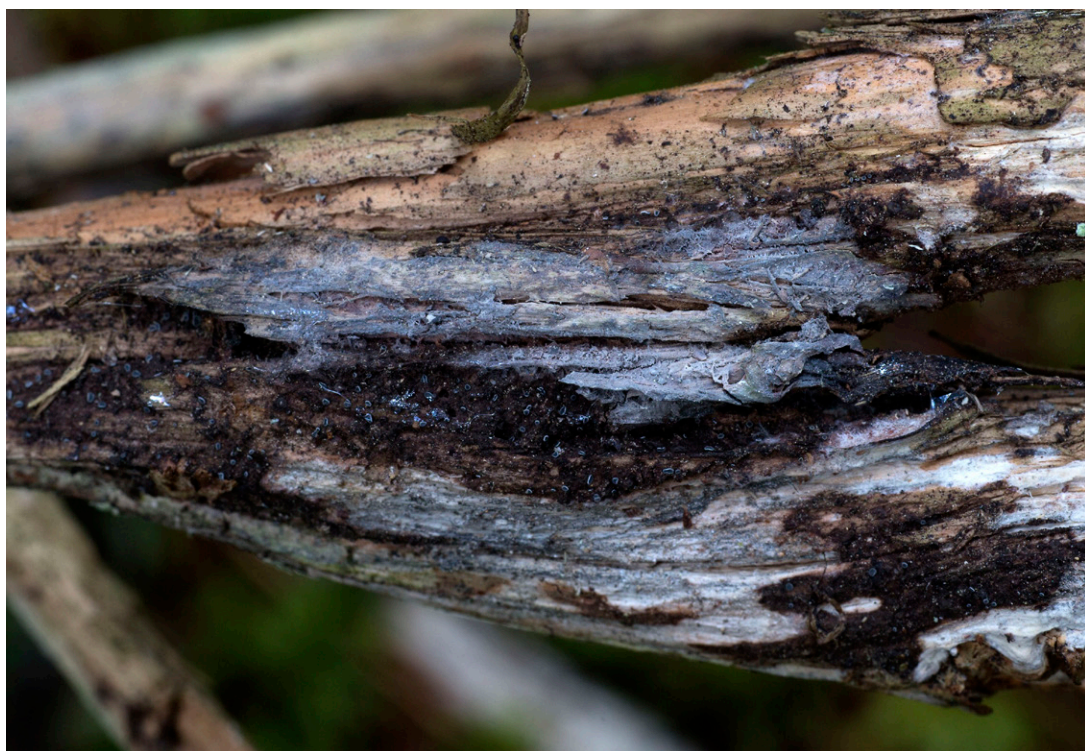
Fig. 23. Xenasmatella borealis in Puolanka (TH 2018137).