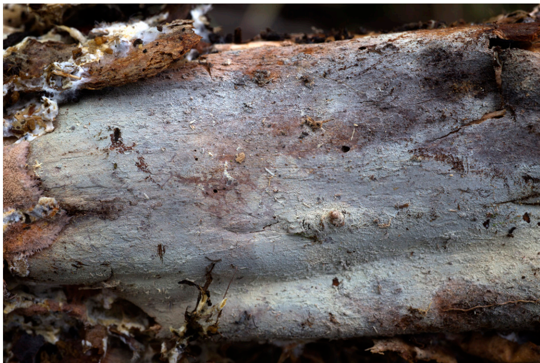
Fig. 17. Trechispora adnata in Pori (TH 2019006).