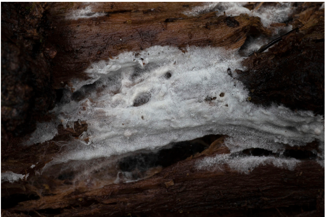
Fig. 16. Sistotrema autumnale in Sotkamo TH 2018194.