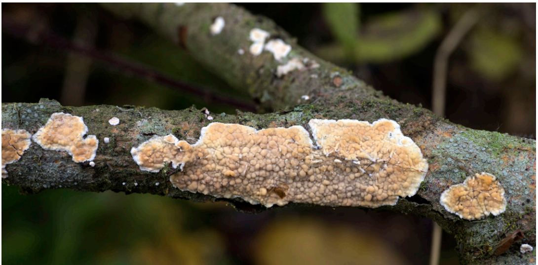
Fig. 2. Byssomerulius jose-ferreirae in Pori (TH 2019005).

This is the eighth record in Finland; previous records were reported from Hämeenlinna (two sites, 2a), Kankaanpää (2a), Jyväskylä (2b), Lapinlahti (2b), Toivakka (2b), and Keminmaa (3c) (Kotiranta et al. 2009, Kunttu et al. 2018).