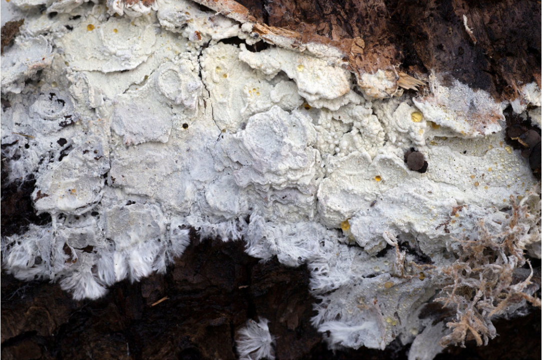
Fig. 18. Trechispora invisitata in Ulvila (TH 2019015).