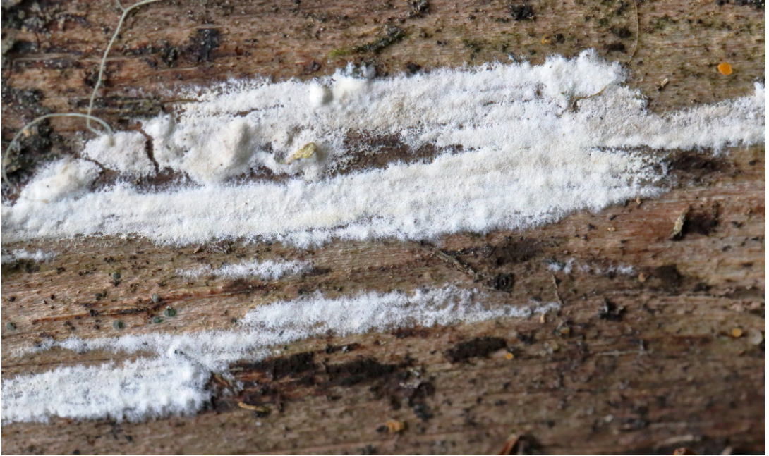
Fig. 14. Saccosoma farinaceum in Padasjoki (JJ1387).

These are the ninth and tenth records from Finland; previous records were reported from Padasjoki (2a), Viitasaari (2b), Puolanka (three sites, 3b), and Kajaani (three sites, 3b) (Kotiranta et al. 2009, Kunttu et al. 2016, 2018).