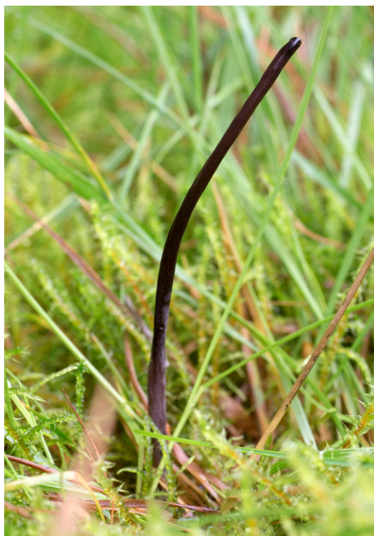
Fig. 3. Clavaria atrofusca in Pori (TH 2019008).