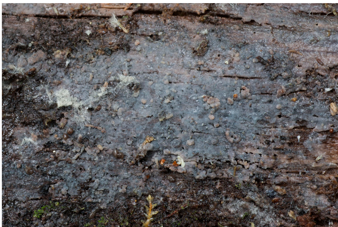
Fig. 9. Helicogloea sebacea in Hyrynsalmi (TH 2018093).