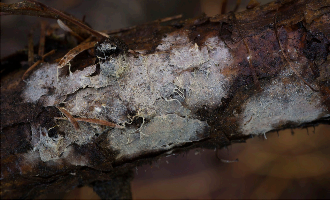
Fig. 4. Coronicium alboglaucum in Kajaani (TH 2019017).