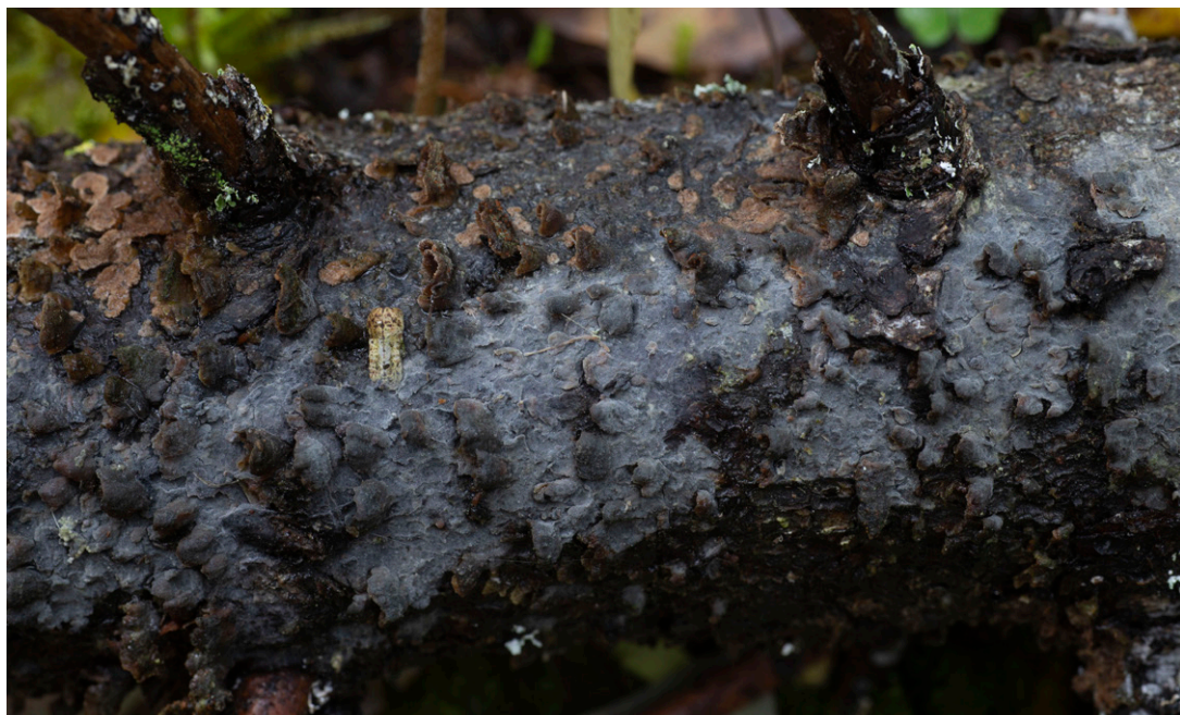
Fig. 22. Xenasma rimicola in Sotkamo (TH 2019011).