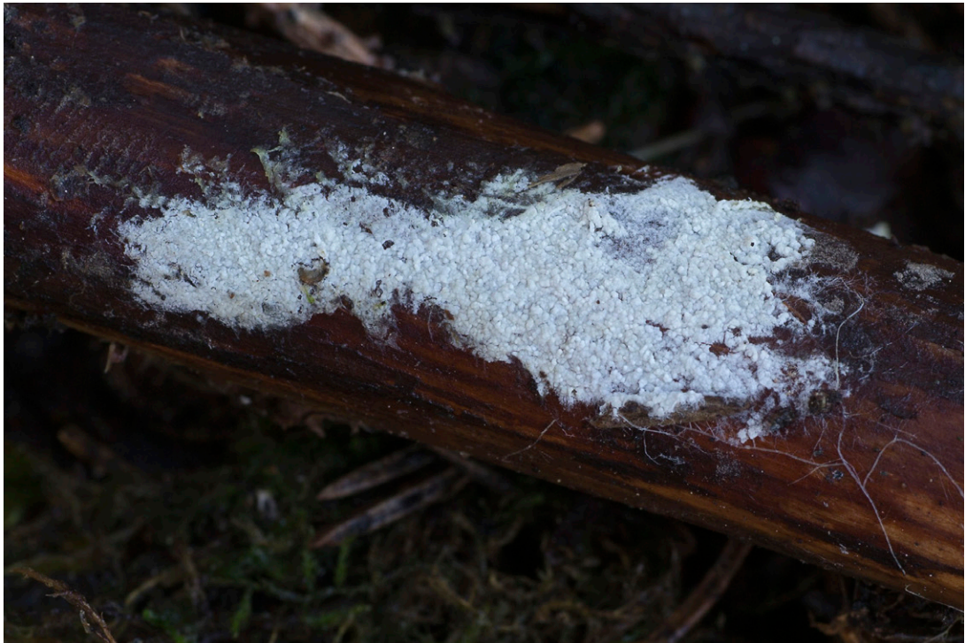
Fig. 5. Cristinia helvetica in Kajaani (TH 2019007).