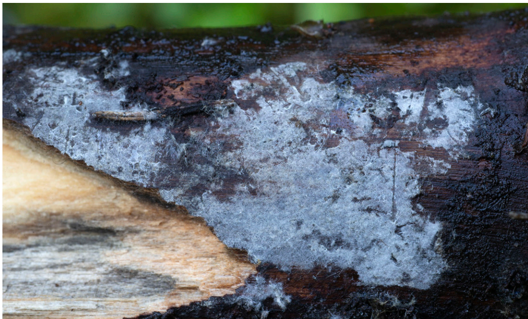
Fig. 6. Endoperplexa enodulosa in Sotkamo (TH 2019019).