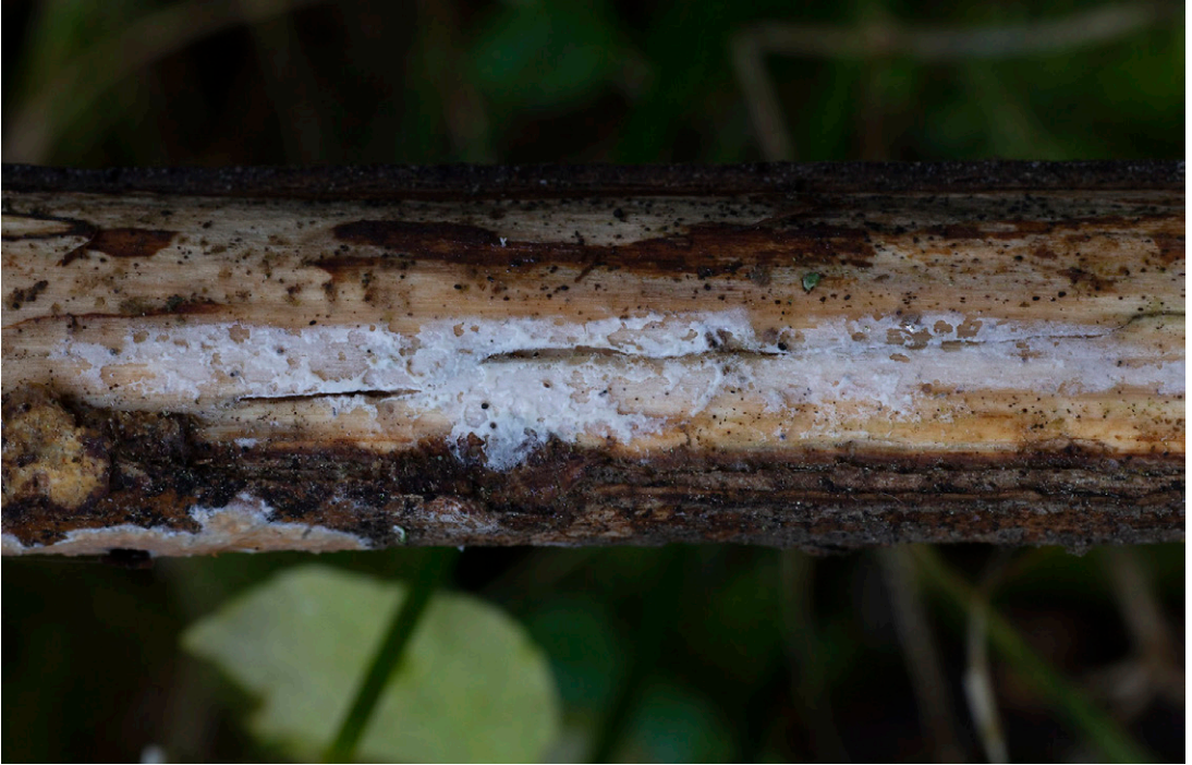
Fig. 10. Hyphoderma nemorale in Kajaani (TH 20170048).