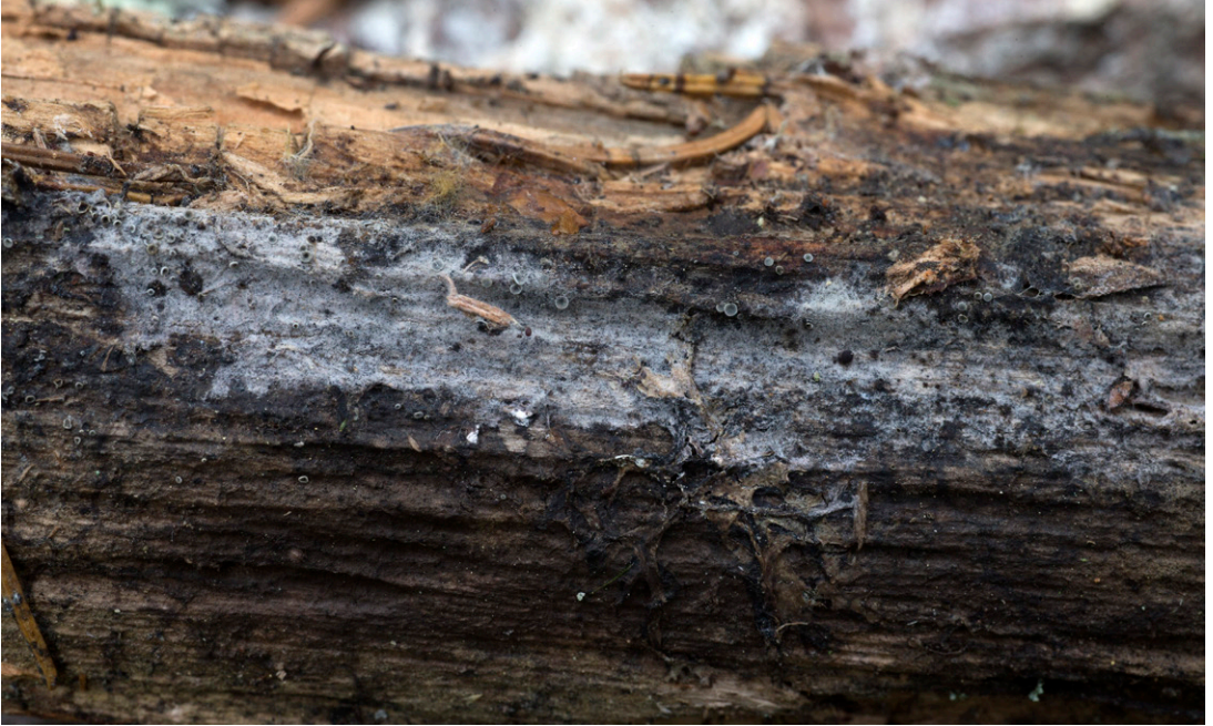
Fig. 20. Tulasnella pallida in Puolanka (TH 2018161).