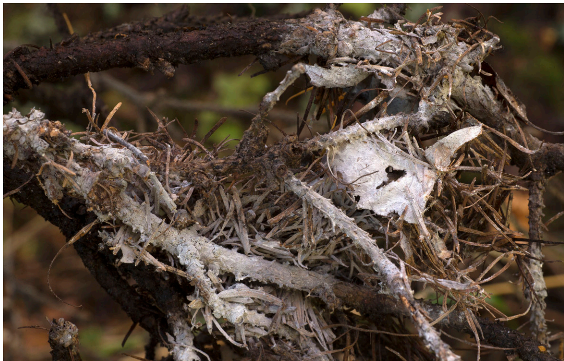
Fig. 19. Trechispora minuta in Kajaani (TH 2019003).

with Botryobasidium subcoronatum in a young aspen-dominated herb-rich heath forest with a high amount of thin dead wood, 8 Oct 2019, leg. & det. TH 2019014 (OULU), conf. MK.