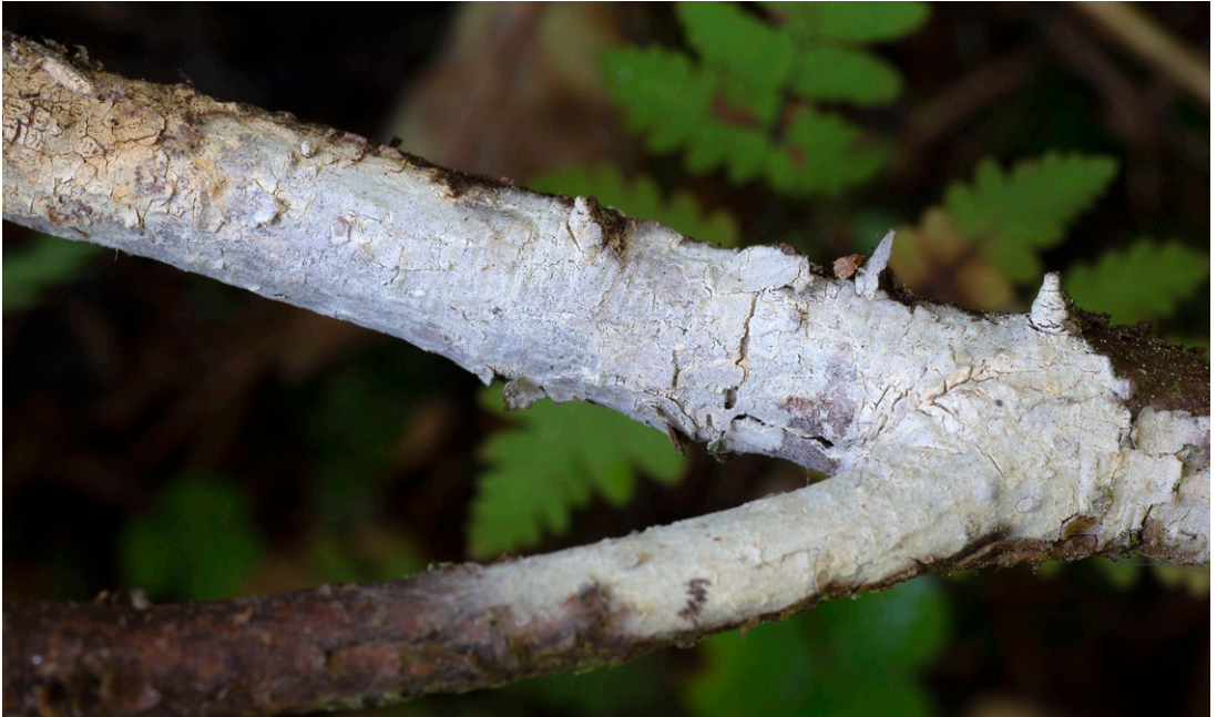
Fig. 15. Scytinostromella nannfeldtii in Sotkamo (TH 2019010).