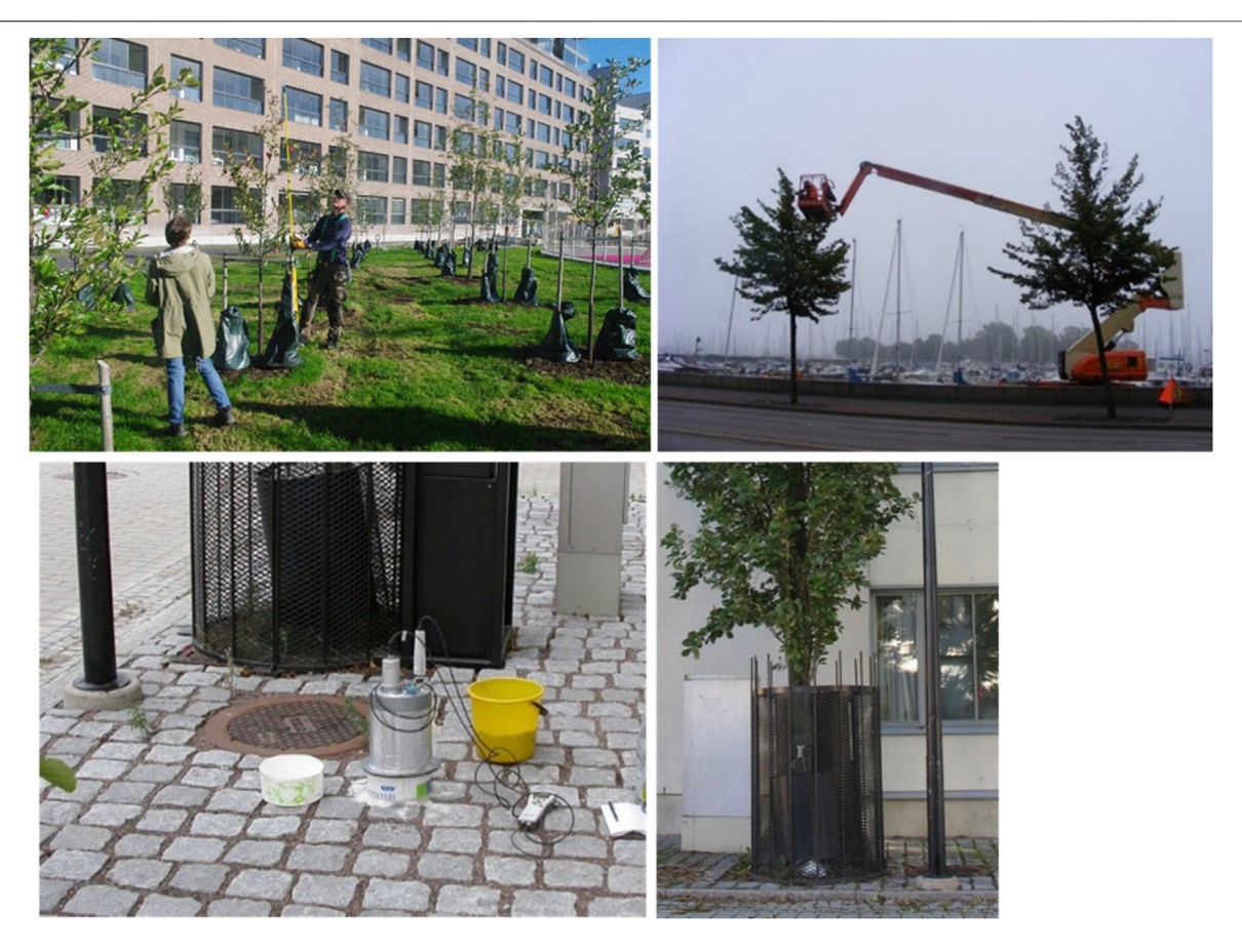
FIGURE 1 | (A–D) clockwise]. Measurements of tree dimension from young trees in Hyväntoivonpuisto (A) and demonstration of how complicated can the collection of leaf biomass samples from street trees higher than 2–3 m be (B) . Portable chamber system with infrared carbon dioxide analyzer and temperature and relative humidity probe for soil CO<sub>2</sub> flux measurement (C) . Sensors installed on urban tree trunks can be protected by surrounding the entire tree base in custom made steel mesh cage (D) .

The effects of biochars on native soil C (priming effect) over time are relevant to be considered as well. The priming effects can even have a larger impact on C sequestration potential than the direct effect of biochar addition, and first long-term field studies on the issue are promising (Weng et al., 2017; Blanco-Canqui et al., 2020). Namely, biochar addition has been found to enhance soil aggregation and hence, the retention of root-derived C by 20% in 10-year experiment in Australia (Weng et al., 2017) and in Midwestern United States, a SOC increase by twice the amount of biochar C applied was reported 6 years after biochar application (Blanco-Canqui et al., 2020). Thus, long-term experiments combined with repeated and representative soil sampling (including subsoil) are one way for the verification of biochar and SOC sequestration.