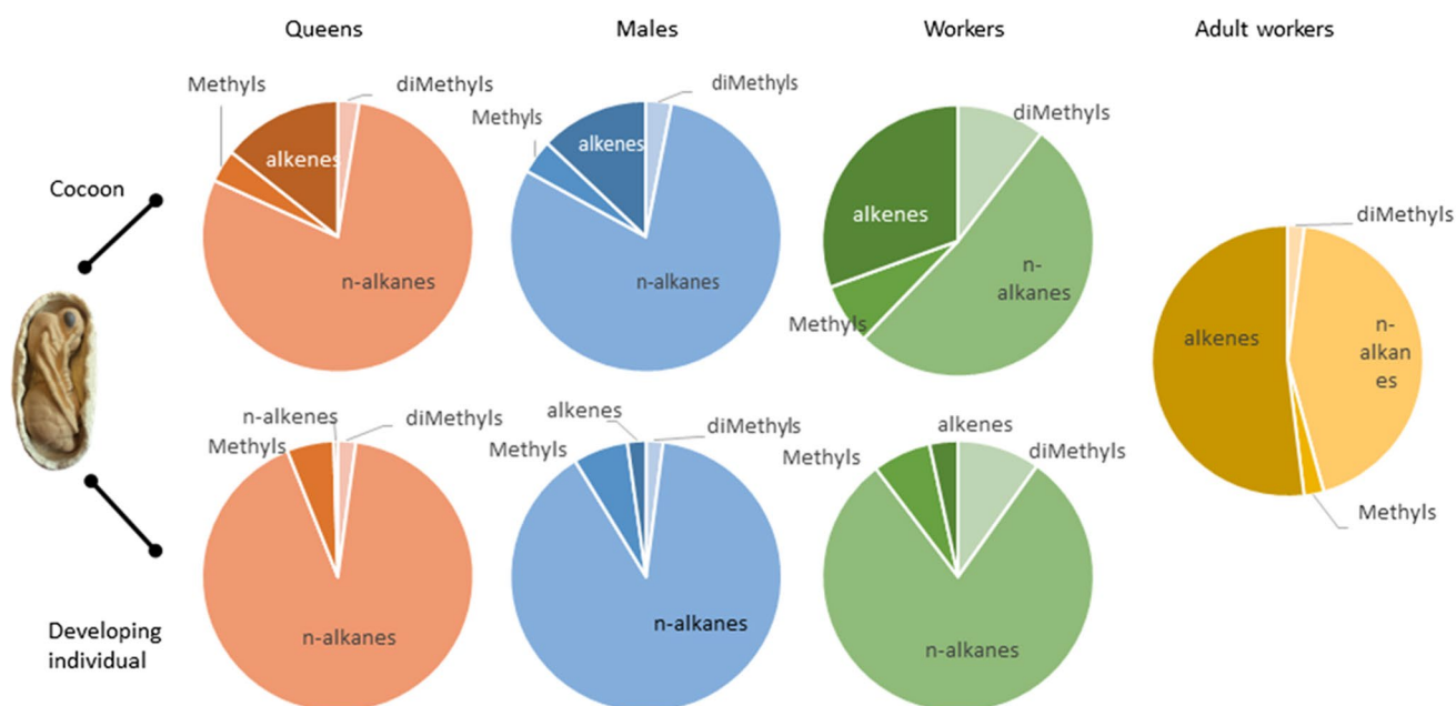
Fig. 1 Relative representation of groups of hydrocarbons ( n -alkanes, alkenes, monomethylated and dimethylated alkanes) in gyne, male, and worker pupae, as well as adult workers.

According to the MANOVA the chemical profiles differed significantly among colonies, across all sample categories, and data sets (all compounds, alkenes only, and all compounds but alkenes), except for the data set with all but alkenes in developing gynes (Table 3).