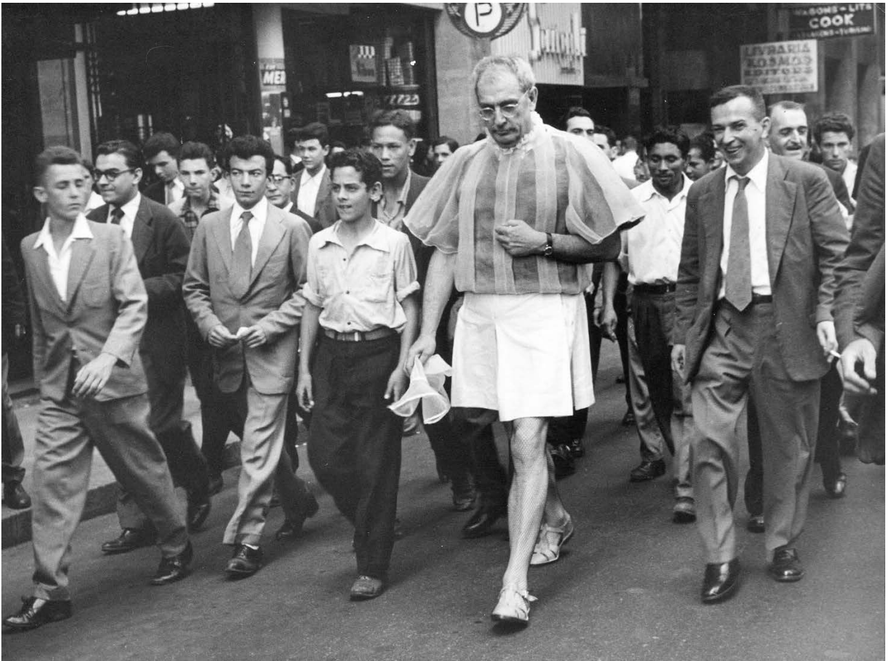
Figure 6. Flávio de Carvalho, Experiência Nº 3: "New Look" (fashion design and performance), 1956.