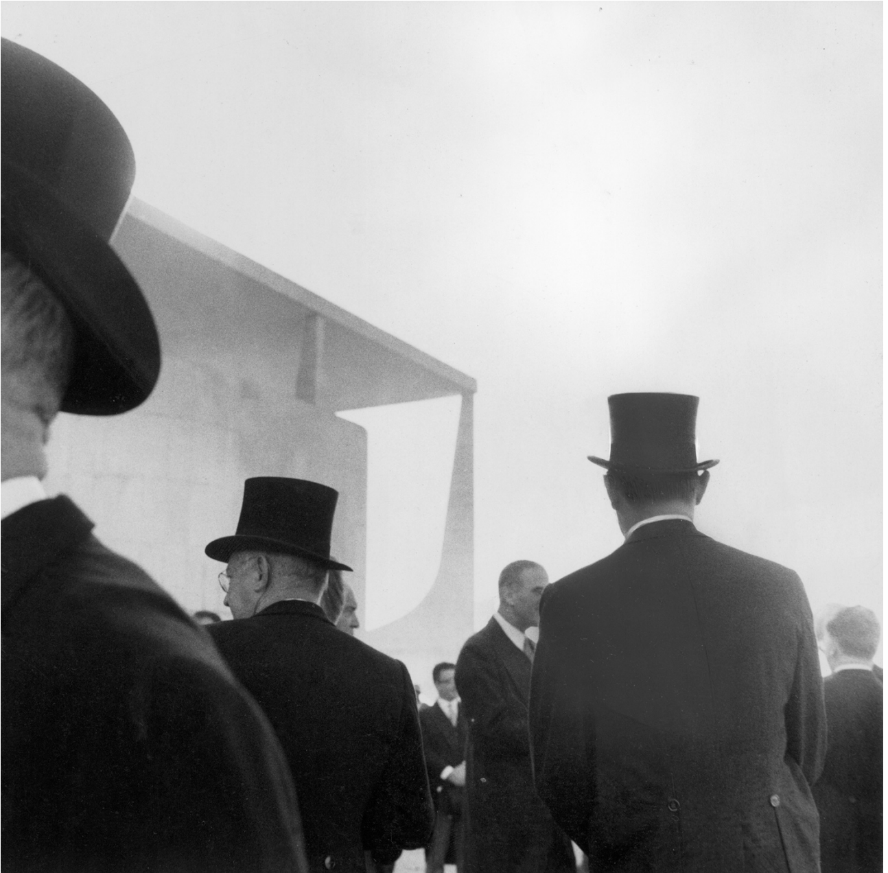
Figure 2. Inaugural day in Brasília, 21 April 1960.