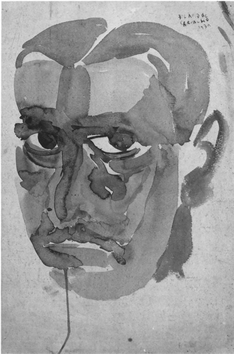
Figure 1. Flávio de Carvalho, Portrait of Oswald de Andrade (watercolour), 1939. Private collection of Israel Dias Novaes, São Paulo.