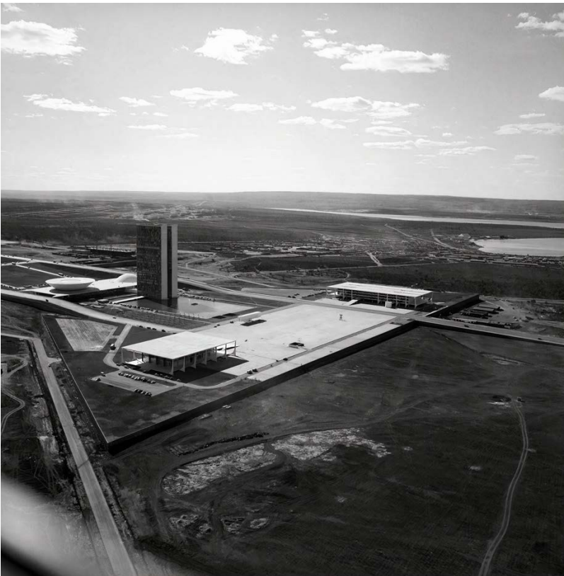
Figure 4. Aerial view of National Congress Palace, Brasília , around 1961. Photo: Marcel Gautherot. Reprinted from Samuel Titan Jr. and Sergio Burgi, eds., Marcel Gautherot. The Monograph (Zurich: Scheidegger & Spiess, 2015), 210.